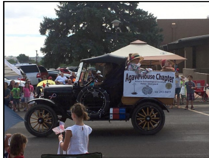
Antique in the Parade