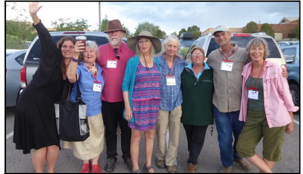
2017 Pecos Conference Attendees