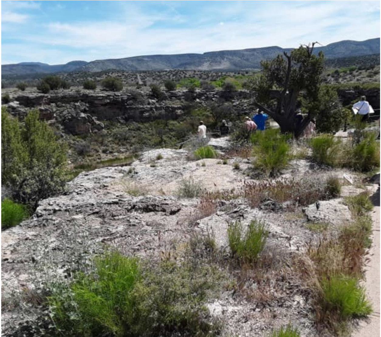
At the Rim of Montezuma Well