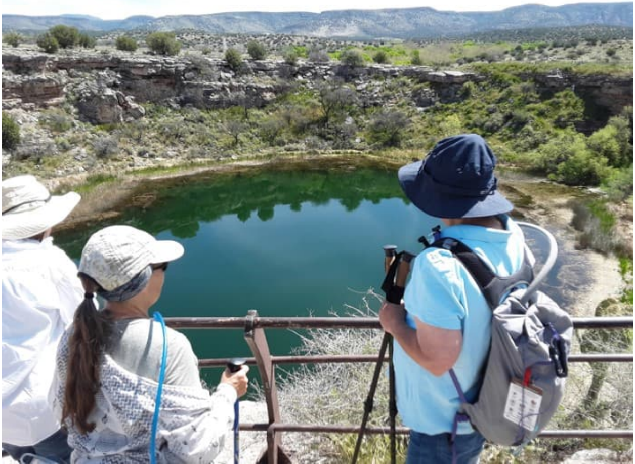
Field Trippers Taking in the View of Montezuma Well

Turning to their left, the Field trippers can see several Cliff Dwelling stone masonry structures built into the inner side of the well, hanging above the water.