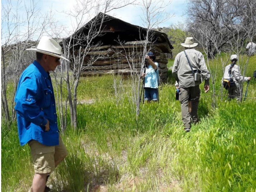
Old Smokehouse from about 1885

The Smokehouse originally had a flat roof. Perhaps at one time it had been a living quarters. Now, inside it is all covered with soot, with meat hooks hanging from the ceiling.