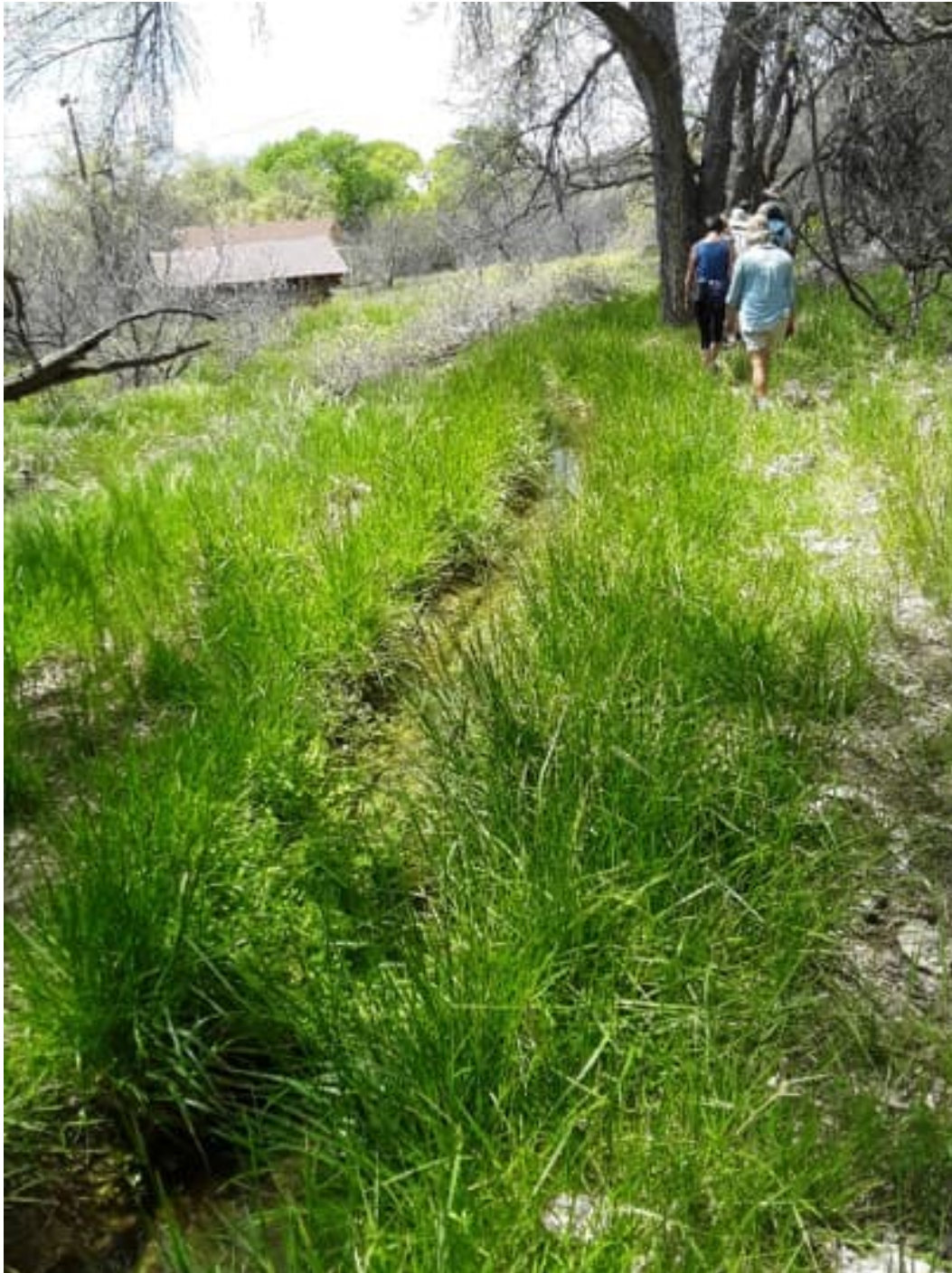
A Long Good Day at Montezuma Well

Old photos from the ranching era show there were no trees or mesquite bosque in the area, only open fields.