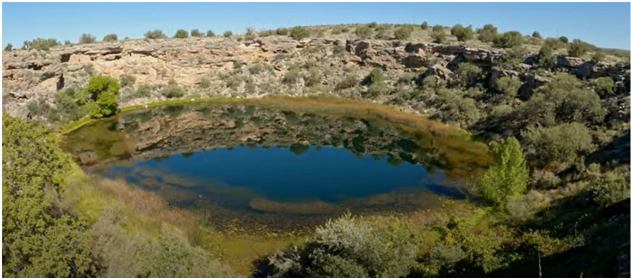
Montezuma Well Note the Cliff Dwellings at the Upper Left

All text and captions to these photos are by Dennis DuBose. Dennis DuBose is responsible for all inaccuracies and errors in text and captions. Unattributed Photos are by Dennis DuBose.