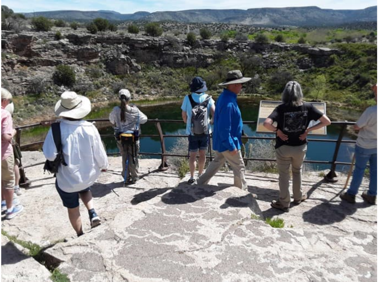
Field Trippers Looking Down into Montezuma Well