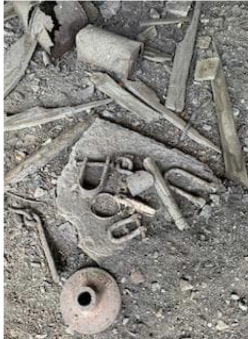
Field Trippers Taking Advantage of the Shade in the Rock Shelter Behind the Ranch House Area, and some Historic Metal Artifacts on its Floor