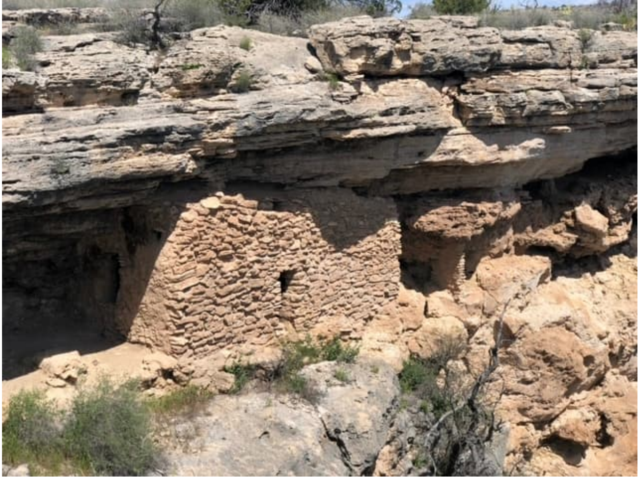
One of the Prehistoric Stone Structures Built into the Inside Rim of the Well