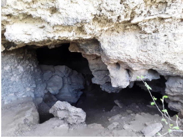
Some of the caves go far back ...