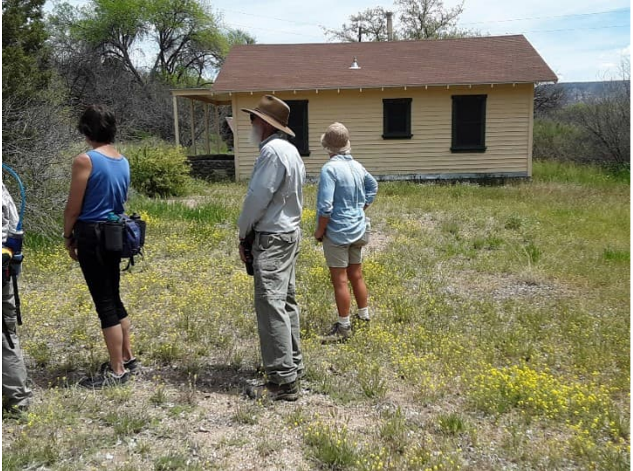
The Back Ranch Family "Kit" House