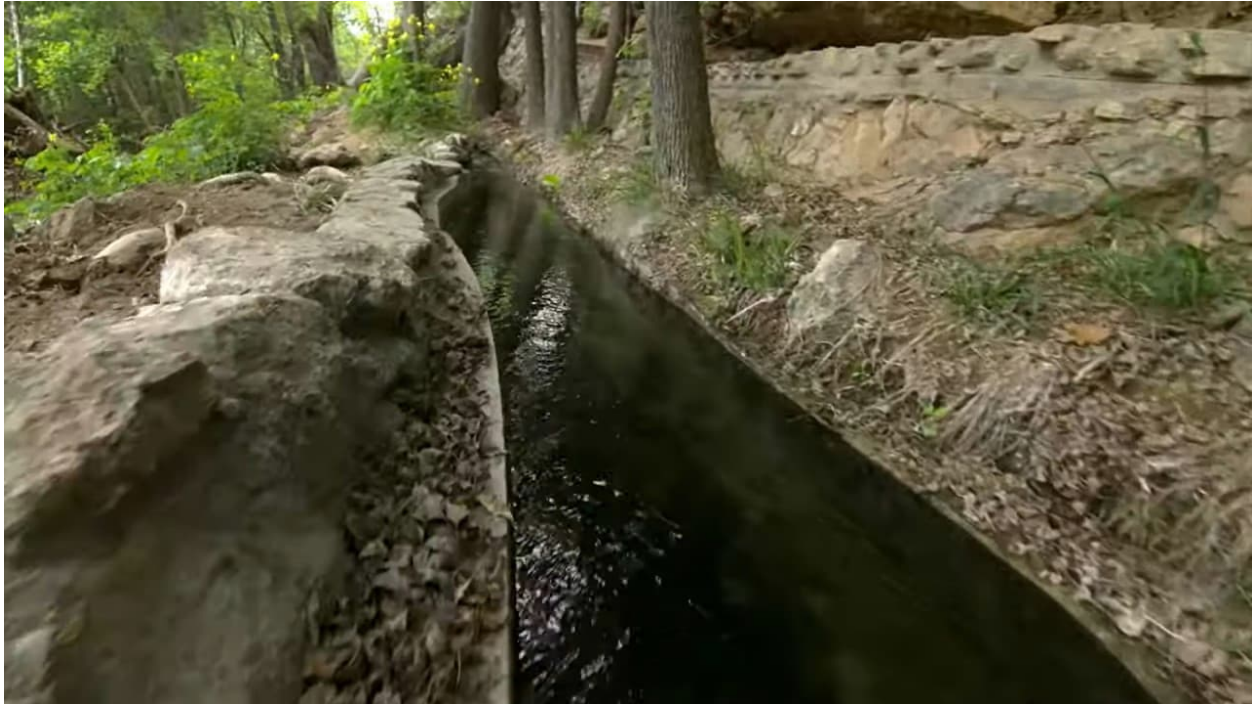
The Montezuma Well Water Exit Canal

The exiting water seeps through 150 feet of porous rock, taking seven-and-a-half minutes to break free. One of the NPS personnel said this had been determined with a dye test.