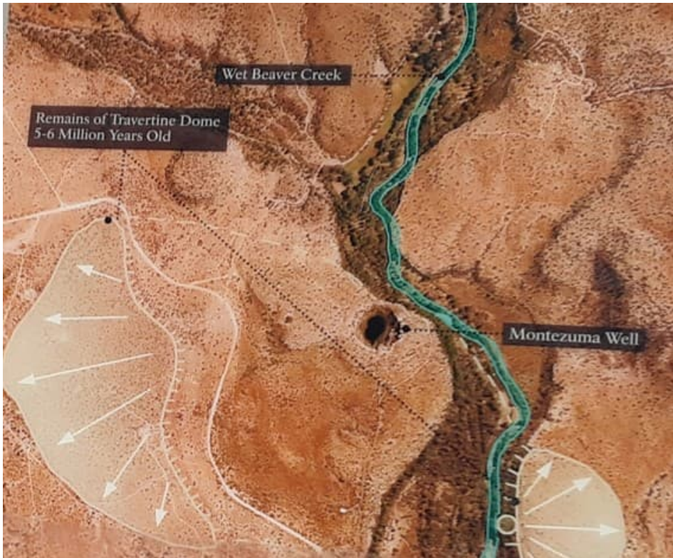
A Map of the Montezuma Well Area from a National Parks Service Display

Note two hikers on the trail down, right center