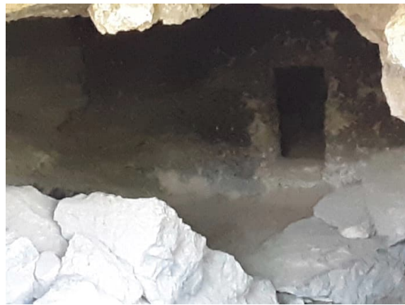
And as your eyes adjust to the darkness ... You can see dwellings deeper inside.

Bats live in the caves during the summer, so after May 1, the trail down to the Grotto is closed.