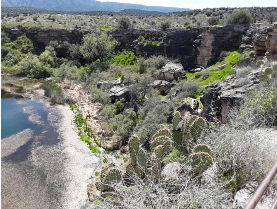
At Montezuma Well Looking Down toward the Grotto

The outflow stream from Montezuma Well flows into Beaver Creek in an underground channel exiting from the Grotto in the clump of trees in the photo below. Beaver Creek is just beyond the rim of the Well.