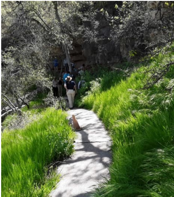
Path to the Grotto