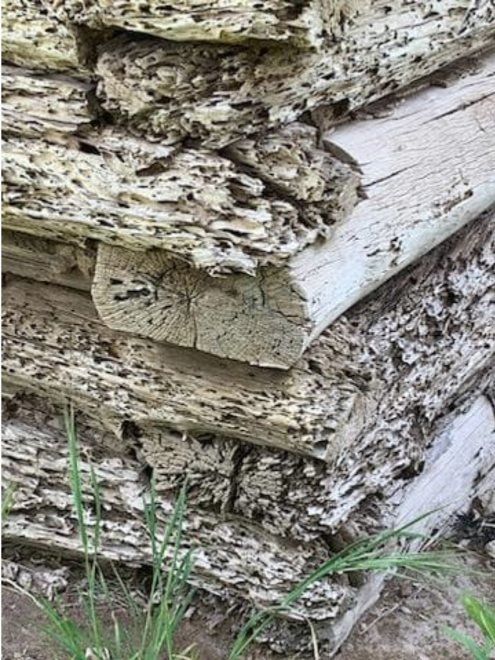
Close-up Detail View of a Corner of the old Smoke House