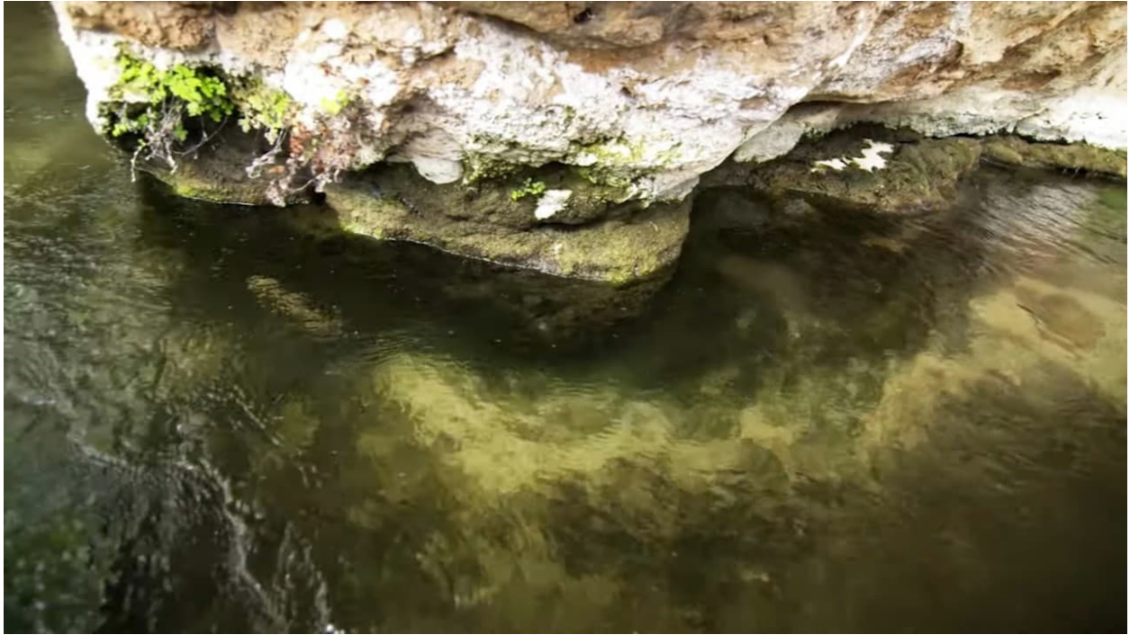
Where the Montezuma Water Seeps out into the Canal, 1.5 Million Gallons a Day

In the Montezuma Well YouTube video cited earlier, there is a good part about the water exit into Beaver Creek starting about Minute 11:25.