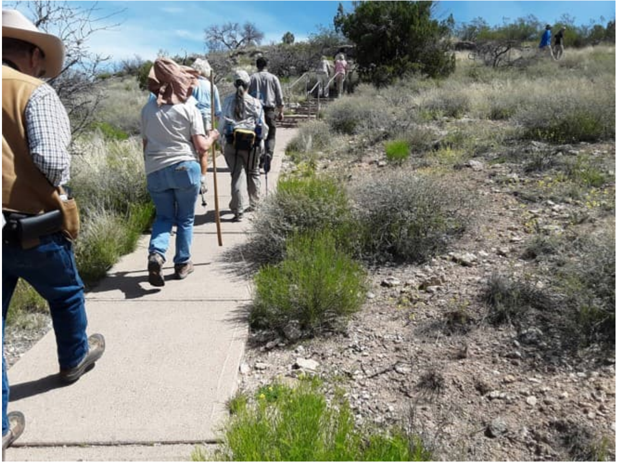
Field Trippers Heading up from the Visitor Center to the Well Rim