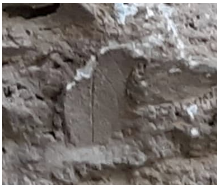
Apparent Fossil Leaf Print in Travertine