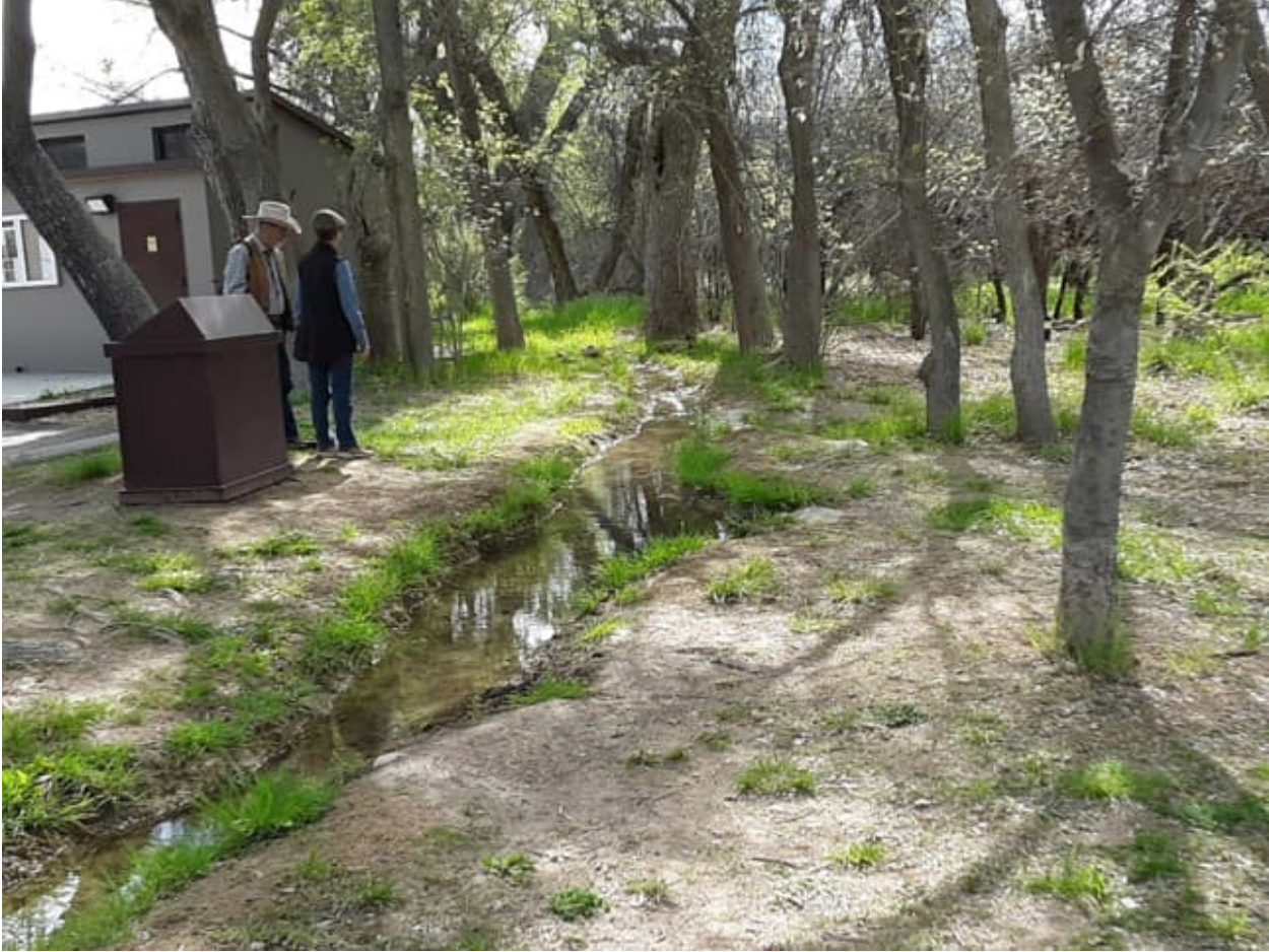
Modern Canal that Runs around the Picnic Area Carrying the Water that Exits the Well