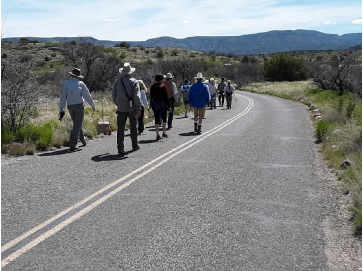
Field Trippers Walking down the Road from the Pithouse to the Well Itself

The roof of the very small Visitor Center can be seen on the hillside right over the head of the column of Field trippers in the above Photo. The Well is centered in the hill just above the Visitor Center.