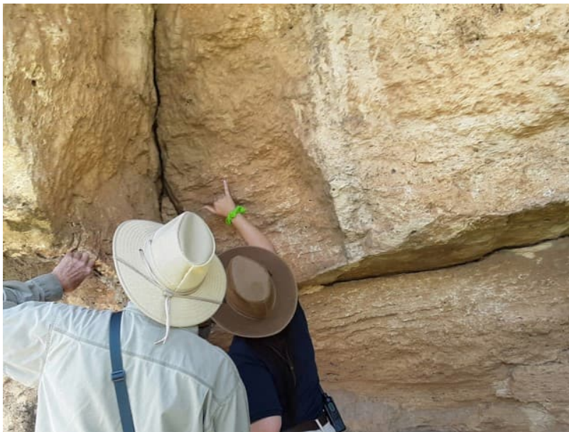
Field Trippers Looking for Leaf Fossil Imprints in the Travertine Boulders along the Trail Down