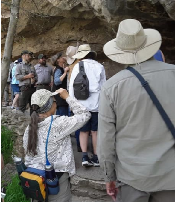
In the Grotto