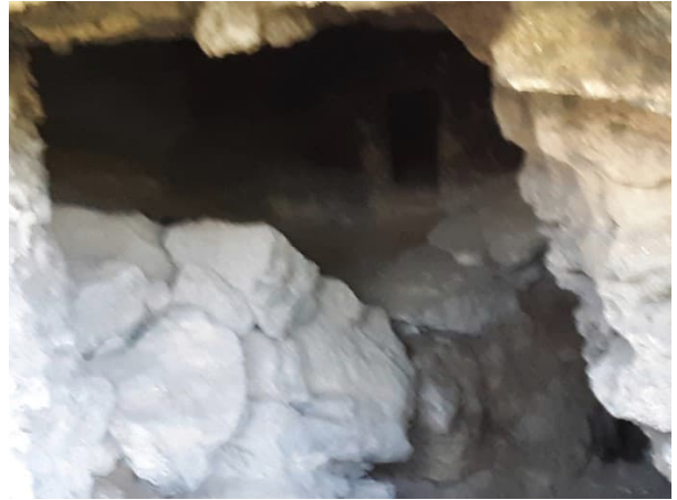
Deep inside ...