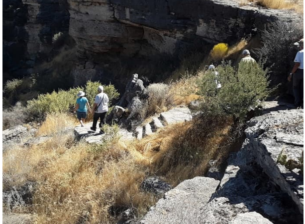
Field Trippers Beginning the Descent into Montezuma Well from the Travertine Deck at the Top, Going Down the 105 Steps to the Bottom Shore