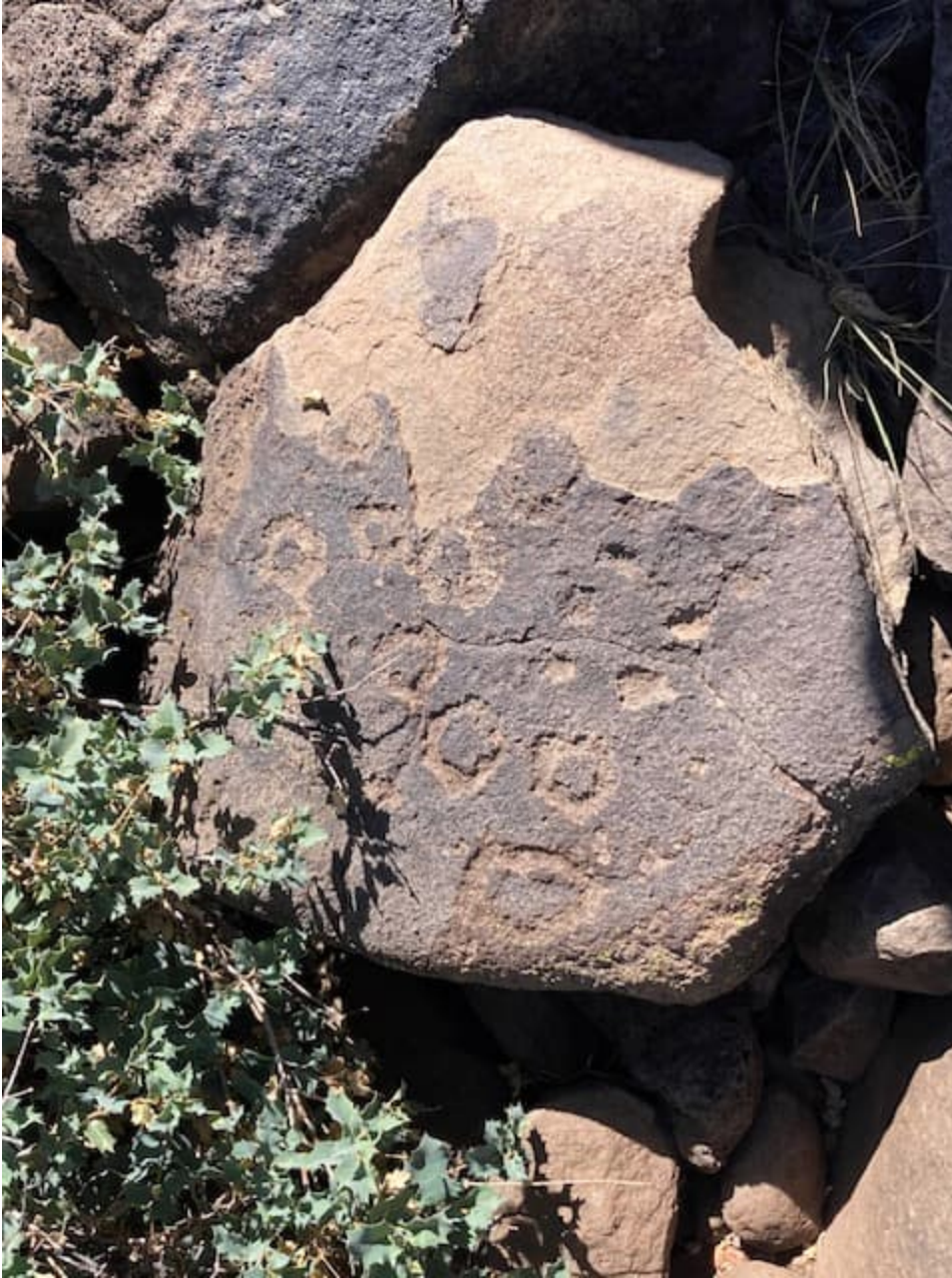
Distinctive small circular glyphs