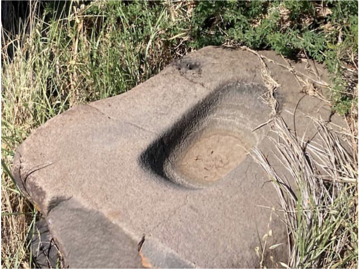
A fine example of a metate ground into a very large basalt boulder