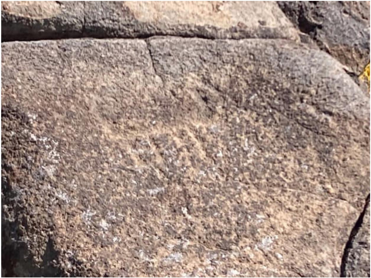
Early, possibly archaic geomorphic or zoomorphic glyph