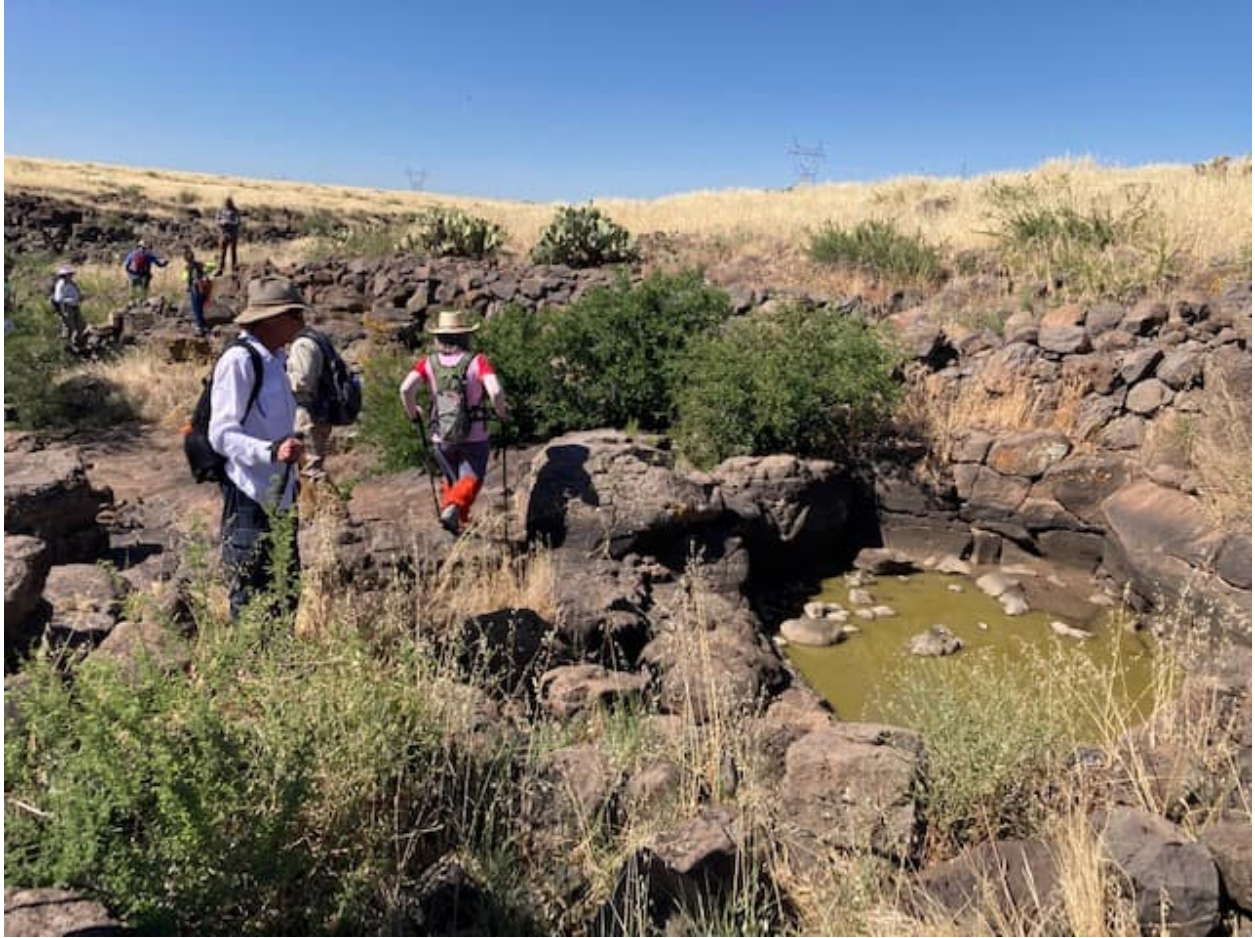
A pool of runoff water, termed a tinaja by the early Spanish explorers