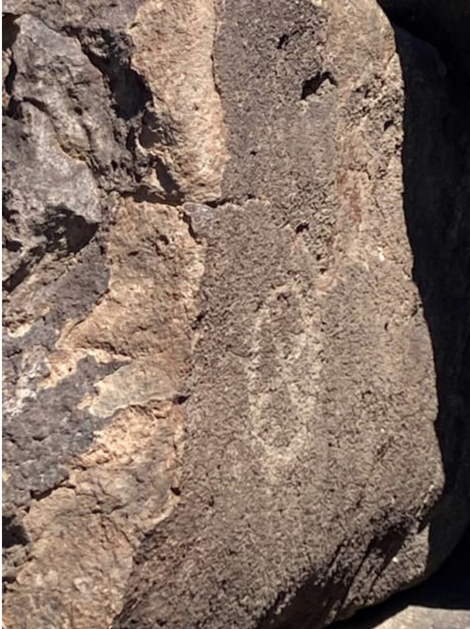
Possibly a Hopi clan sign