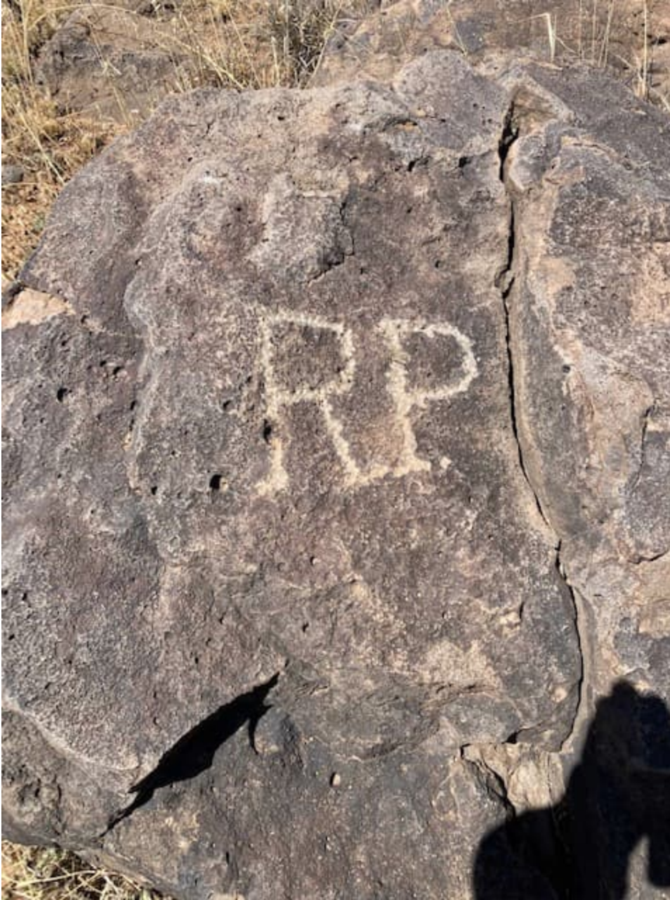
Initials carved on a rock slab, possibly by the historic Euro-American Inhabitant