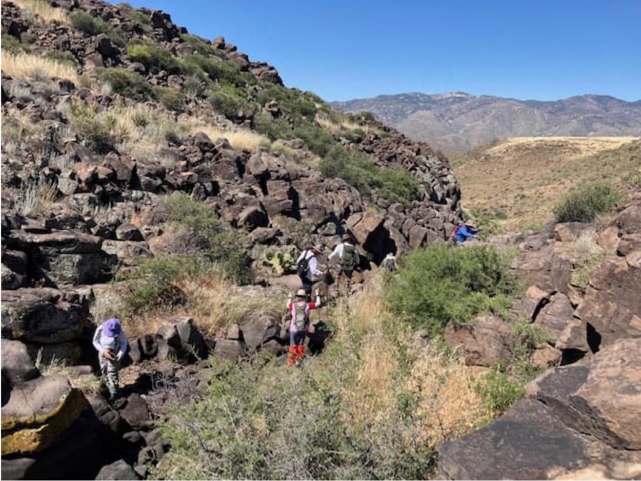
Hikers peer down into the Rocky Gorge