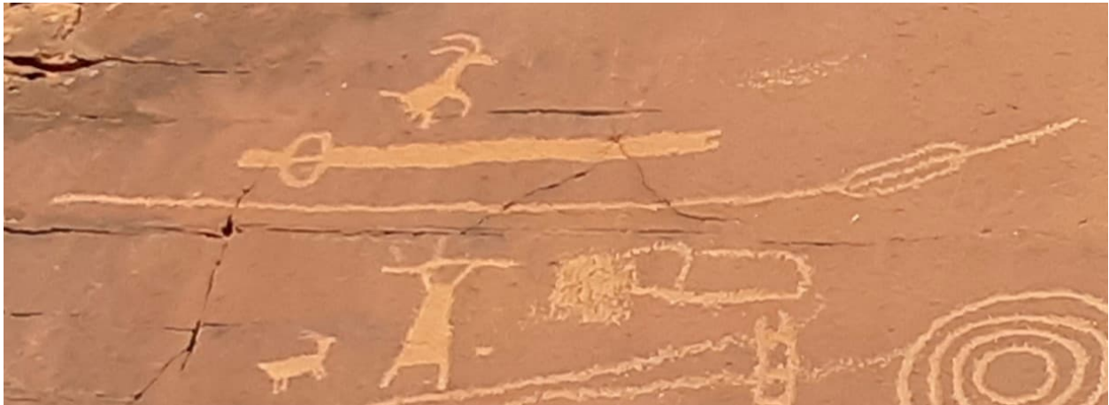
Atlatl, Dart, Person Ready to launch Dart with Atlatl, with Typical Game Animals. Atlatl Rock, Valley of Fire State Park, Nevada.