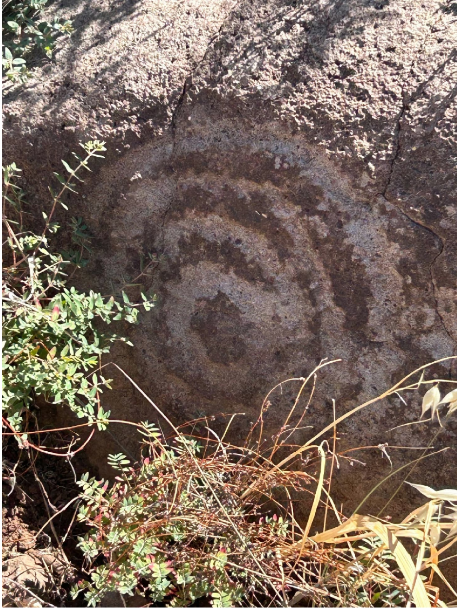
A Closer Look ... Perhaps it is Concentric Circles