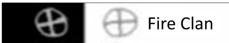
Hopi Fire Clan Symbol