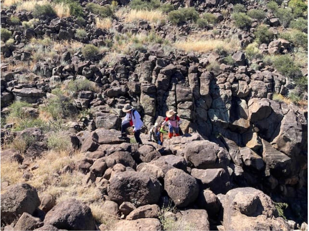
Hikers ascending to the Mesa Top