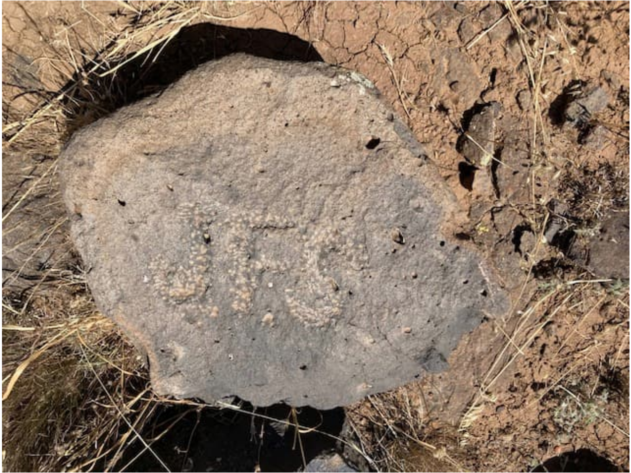
More initials, fainter and possibly older than the preceding