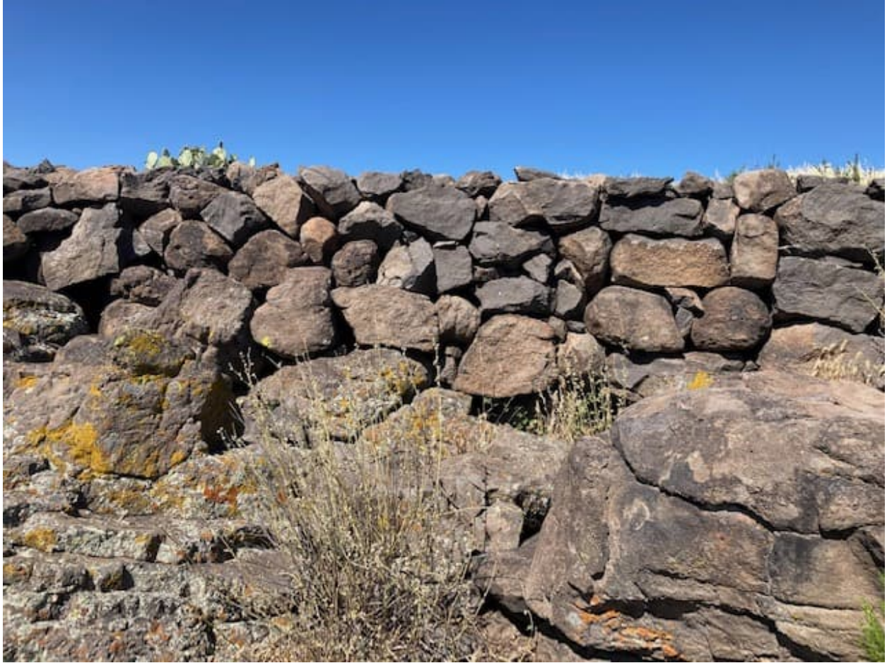
Dry-laid volcanic boulders form the wall of the historic corral on the edge of the canyon