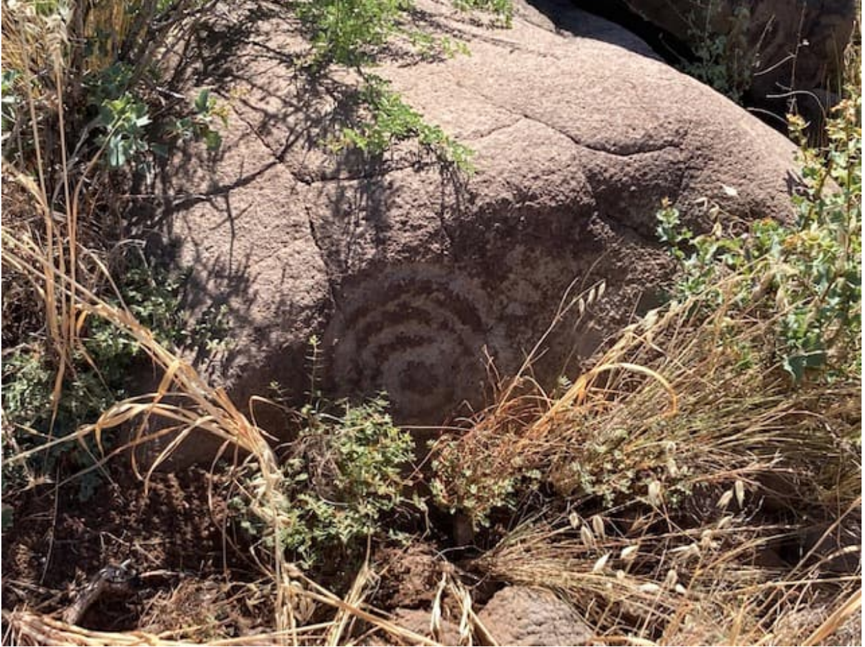
A classic spiral Petroglyph