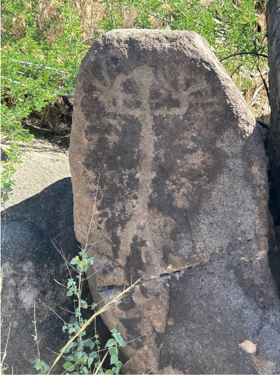
Andromorph Petroglyph Displaying Fingers