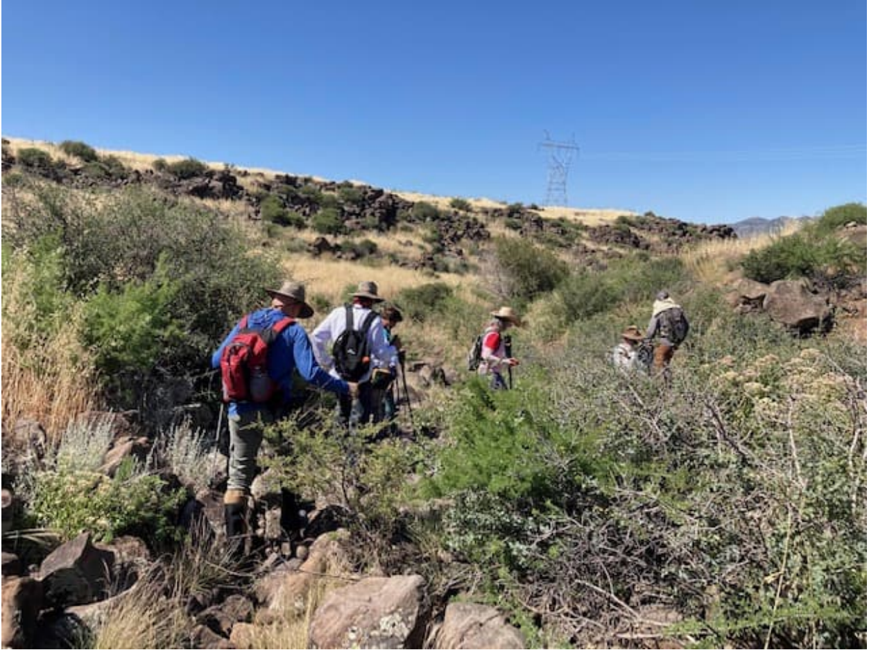
The canyon is choked with boulders and thorny shrubs