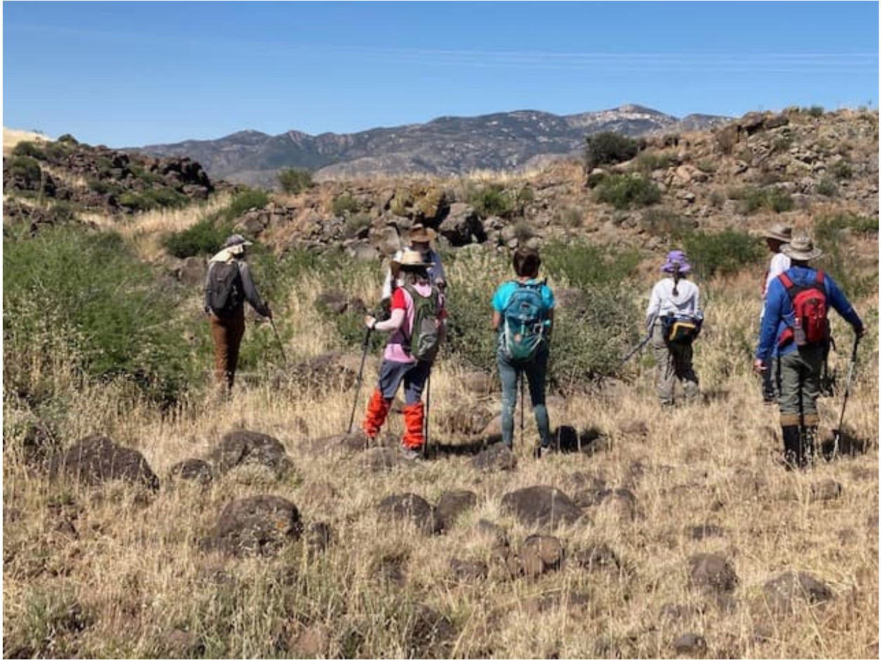
Continuing into the Arrastre Creek Canyon