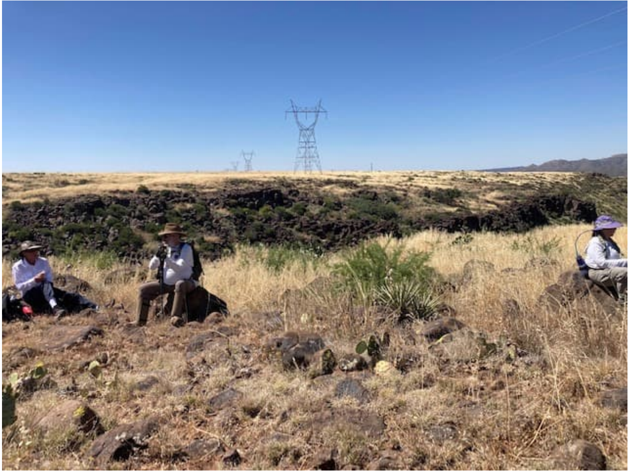
We take a breather midway through our Hike