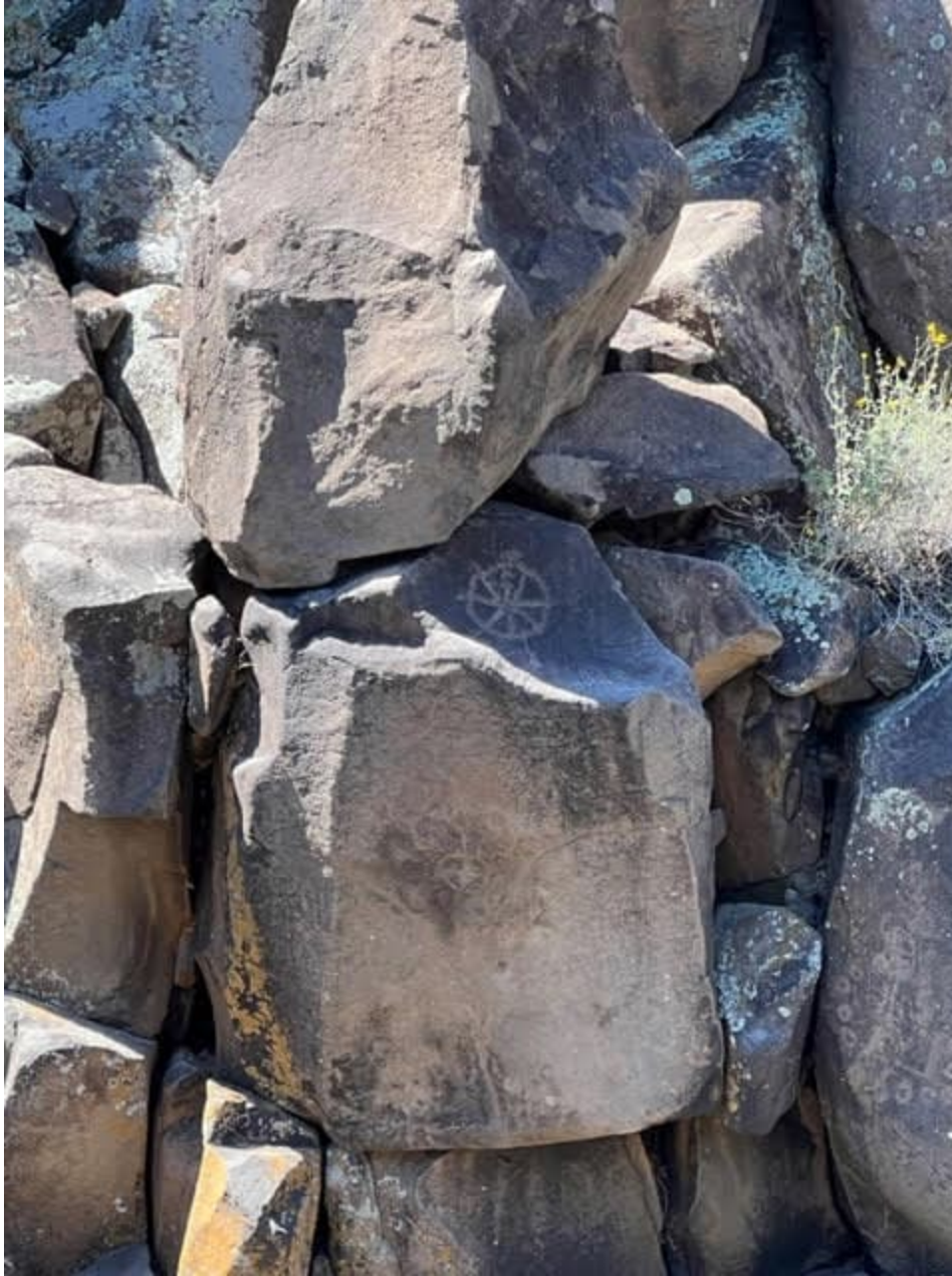
Petroglyph Panel Below Falls