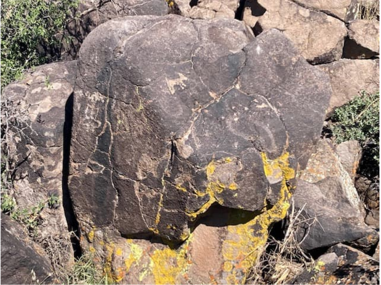
The first glyphs we encountered at the top of the canyon