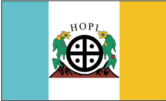
Hopi Tribal Flag

Apparently, this is a Hopi symbol Tuuwaqatsi (also spelled Túwaqachi and tutskwa ) meaning "earth" or "where we live."