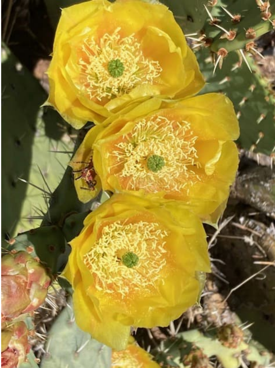
Prickly Pear Cactus Blossoms