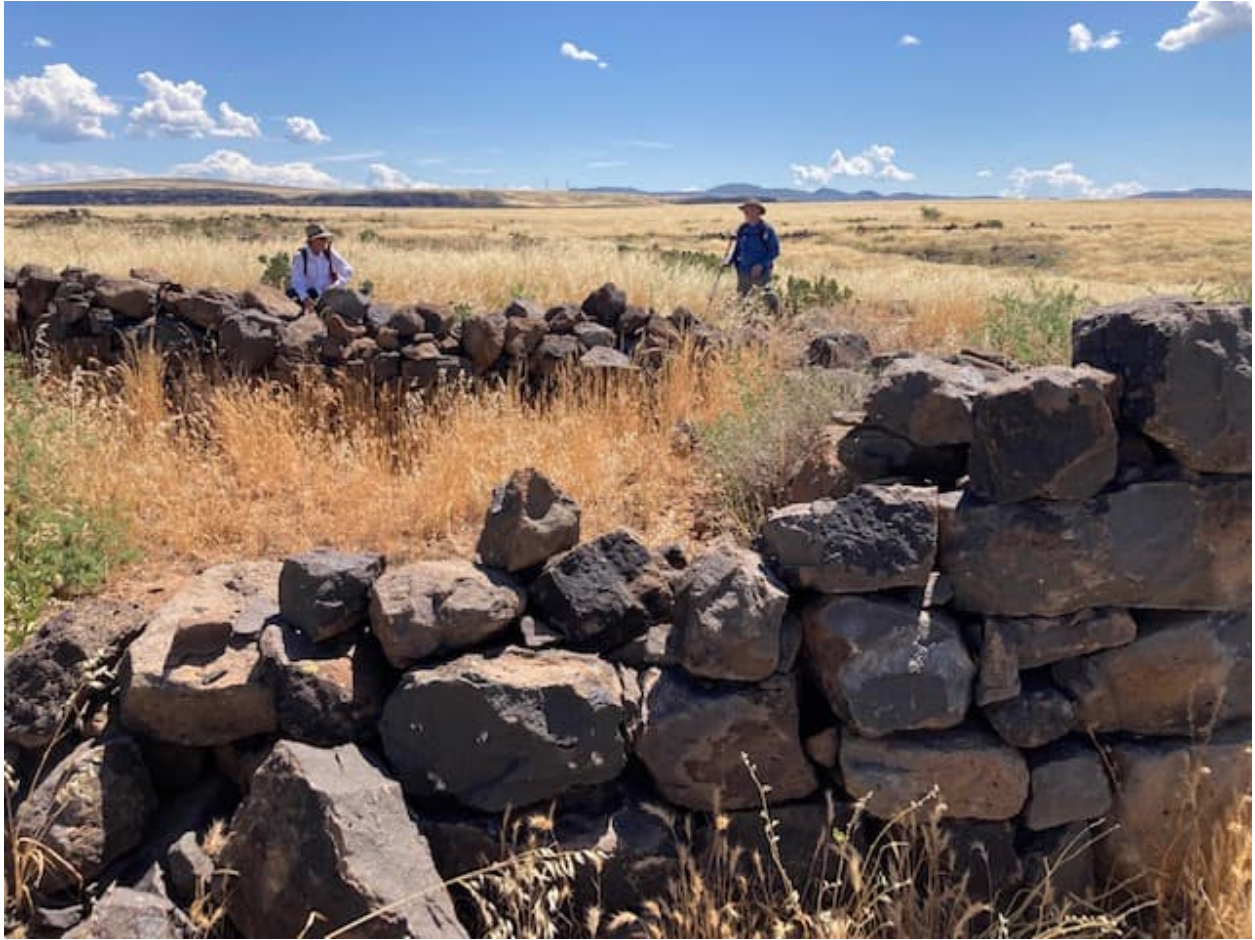
Basalt Boulder walls are all that remain of a Cabin near the Corral