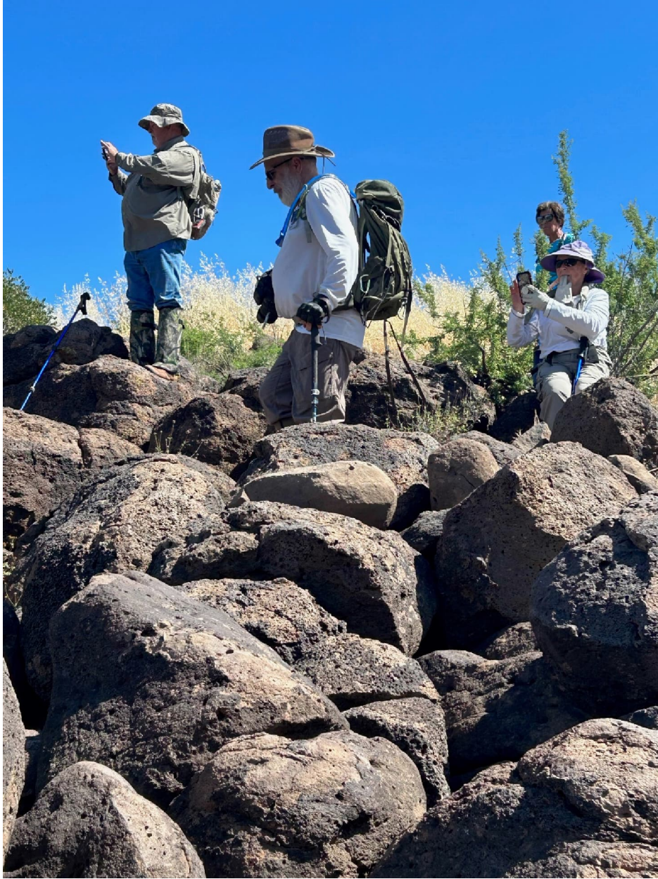
Field Trippers Photographing Petroglyphs on Boulders