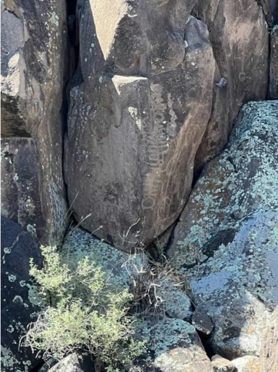
Another Petroglyph Panel Below Falls