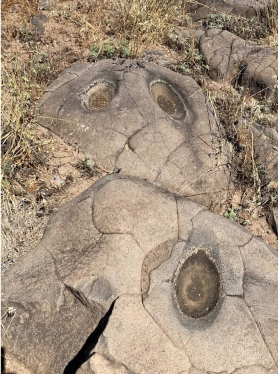
Multiple metates ground into massive boulders or bedrock