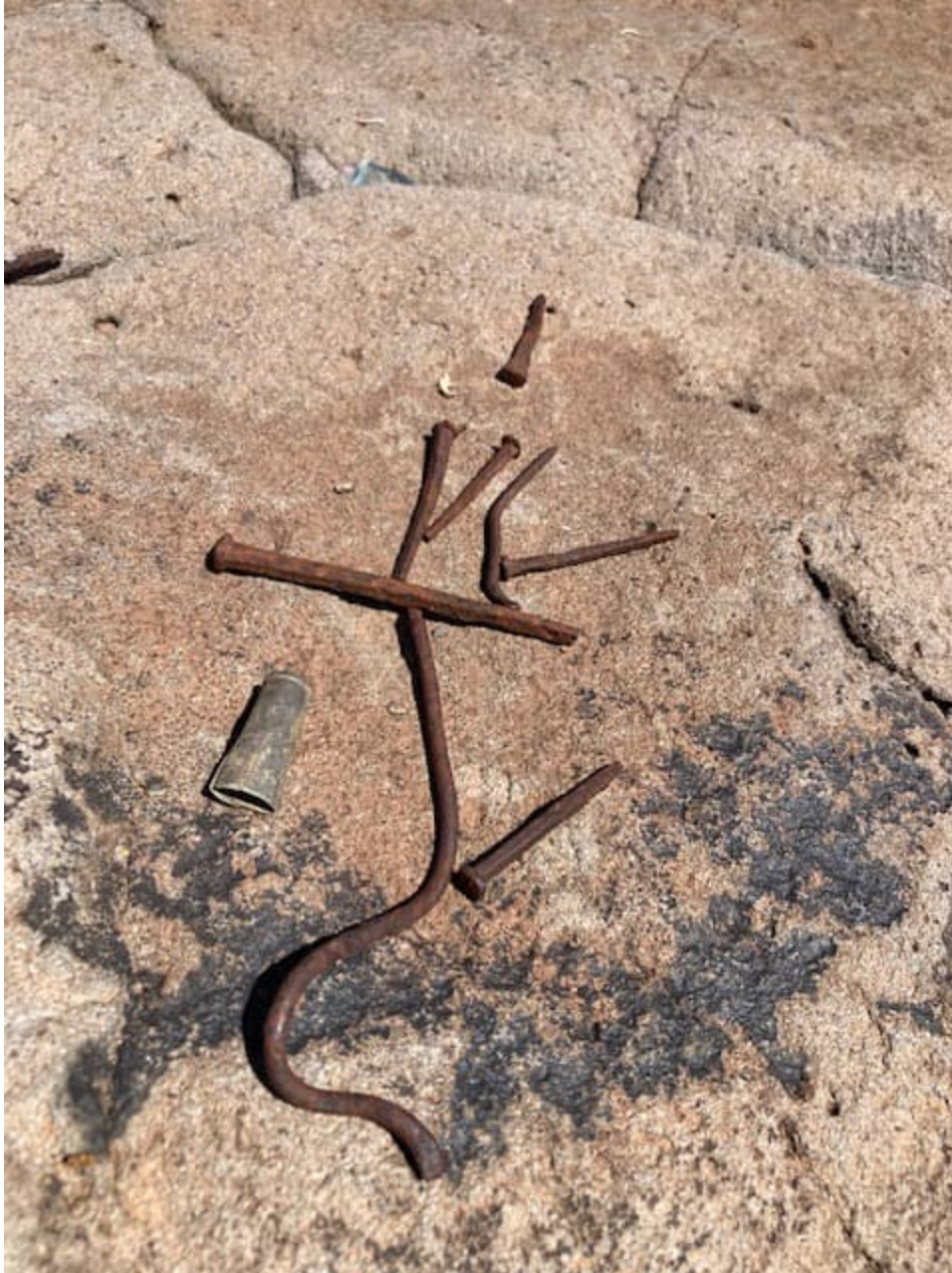
An assemblage of surface finds near the cabin and corral, collected and left by a previous visitor Nails, an expended cartridge, etc.