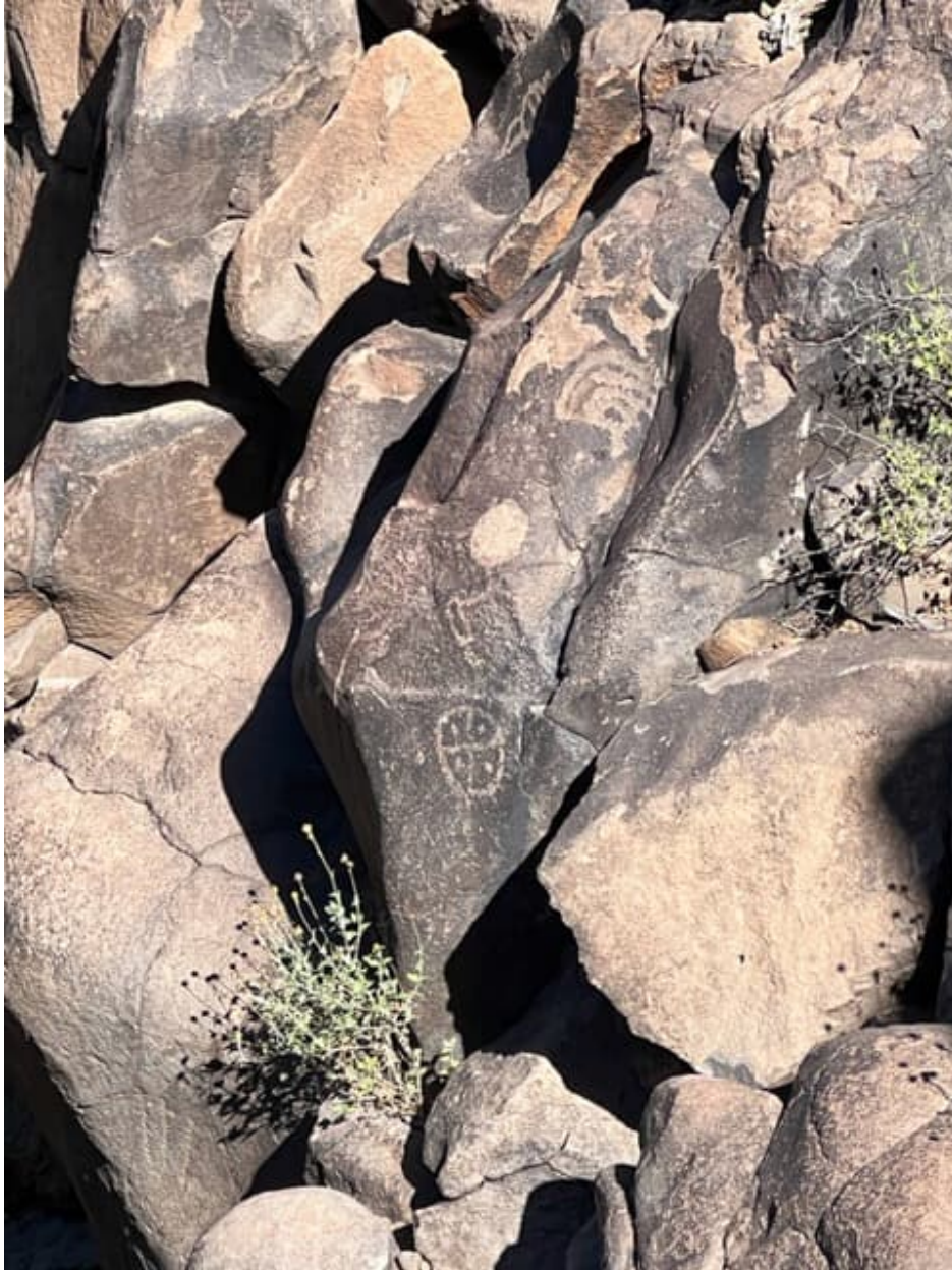
A Petroglyph Symbol below the falls that Appears on the Modern Hopi Tribal Flag

Field Tripper Lee Chandler also pointed out that the circled cross petroglyph with dots in the above panel appears as a symbol on the Hopi Tribal Flag (see below)