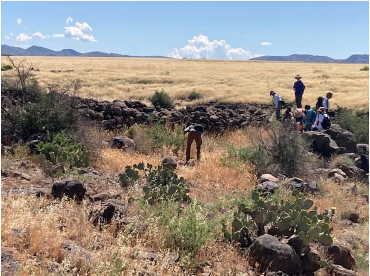
Hikers explore the Mesa-top historic Stone Corral