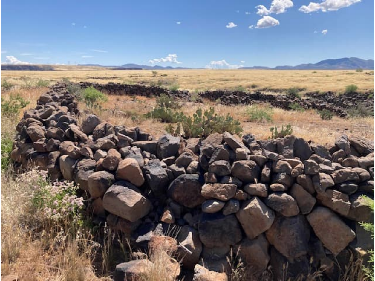
The Stone Corral Surrounds an Area of About a Half Acre in Size