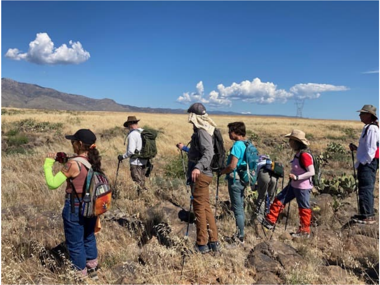
Starting on the trail leading down into the rugged canyon of dry Arrastre Creek