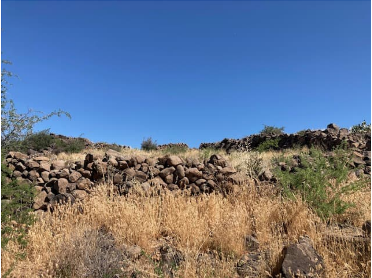
3-4' high Ramparts of the Mesa-top portion of the corral