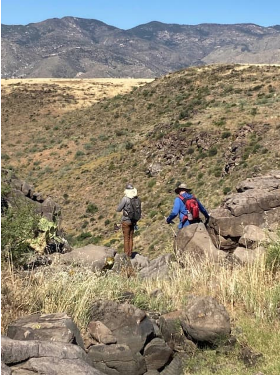
Looking west down the canyon from the top of the big drop that creates a waterfall when Arrastre Creek is running