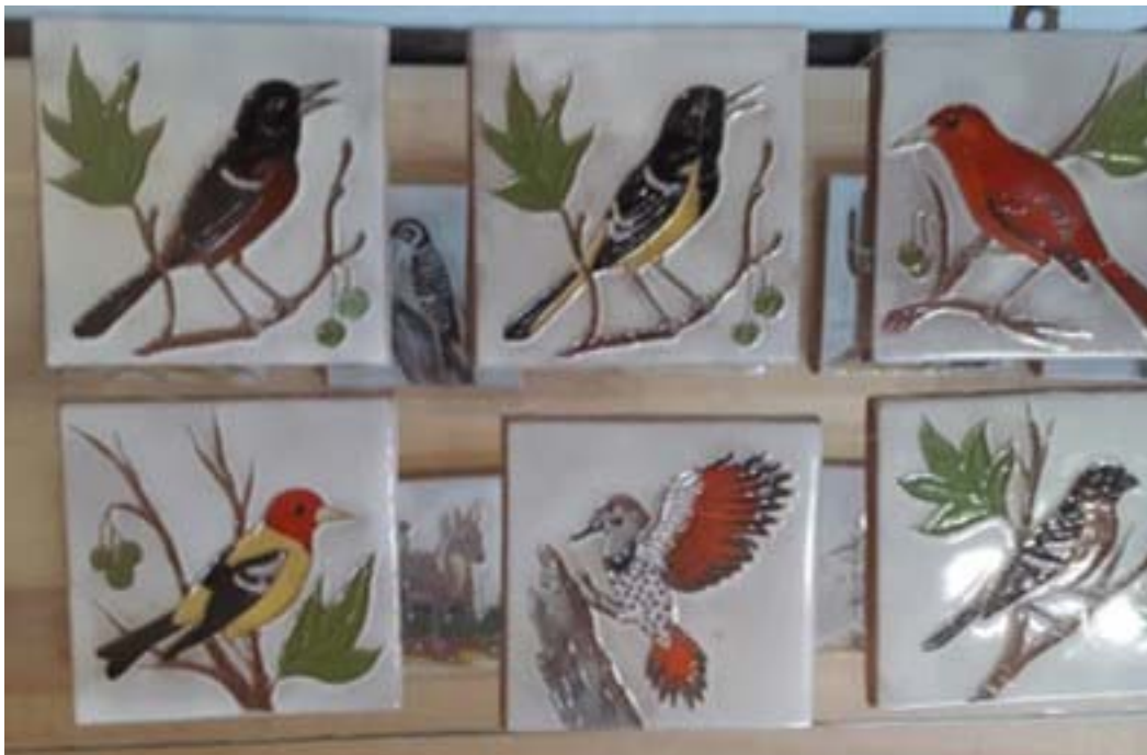
The McKusick Tile Works Exhibit displays many of the tiles painted with images of Arizona Birds