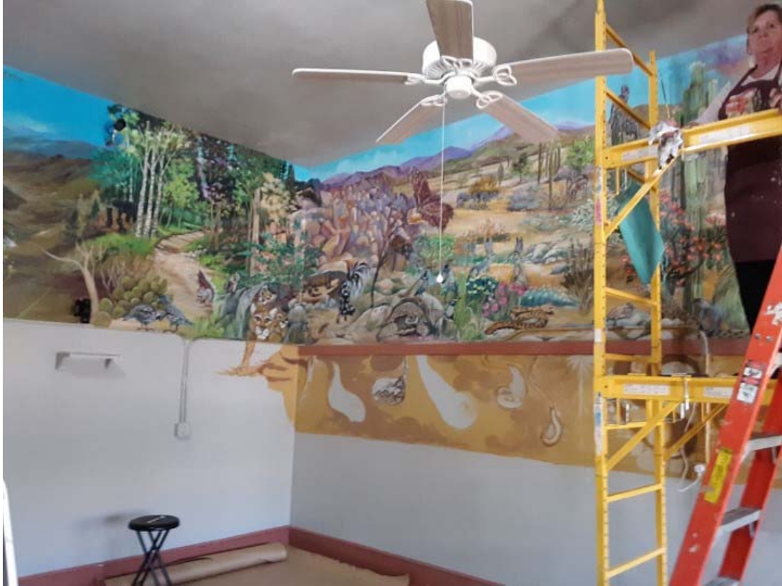
The Mural Depicts a Panoramic View of Arizona, its Flora, and its Fauna, Above and Below Ground