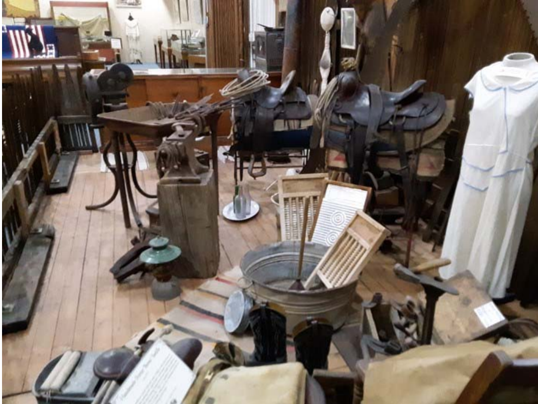
Boots and Saddles, Blacksmith Tools, Lantern, Washboards, Hand-Powered Wringer, the Old Days, and ...