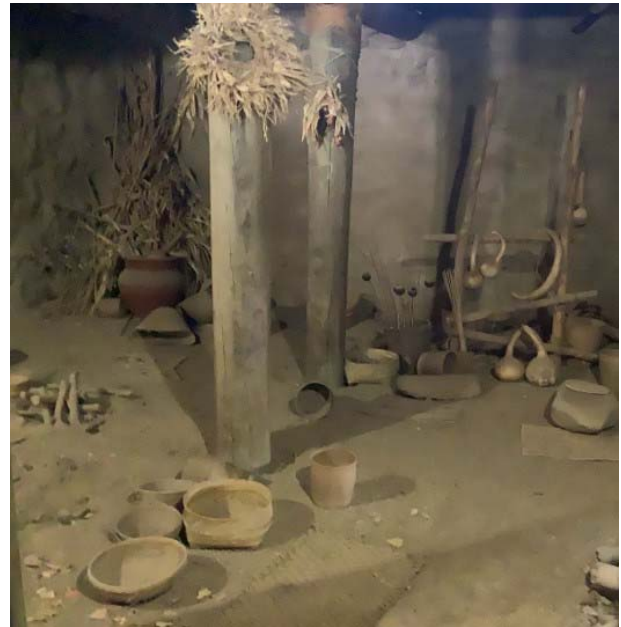
Some Rooms inside are Set Up as they might have Looked in Prehistoric Habitation