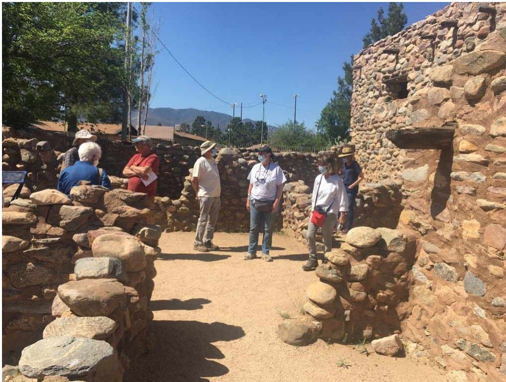
Field Trippers Gathering after Emerging from the Two-Story Reconstruction