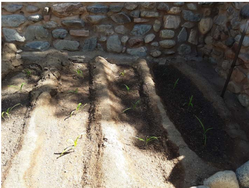
Plot of One Variety of Maize (Corn) at Besh Ba Gowah Ethno-Botanical Garden