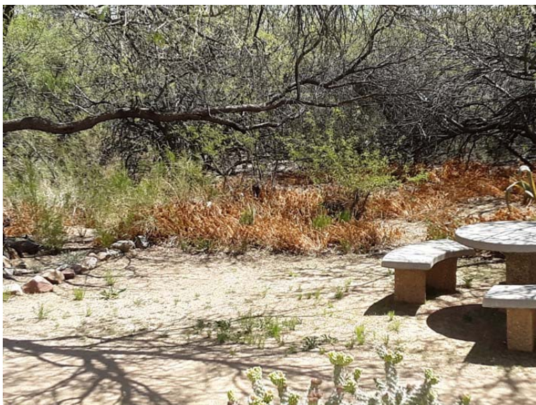
An Unexcavated Room at Gila Pueblo

It appears that early excavations, followed by reconstruction, were then followed by destruction. The site was originally on private land, but sometime after excavation it was donated to the University of Arizona, which moved the collected artifacts to its Tucson Campus.