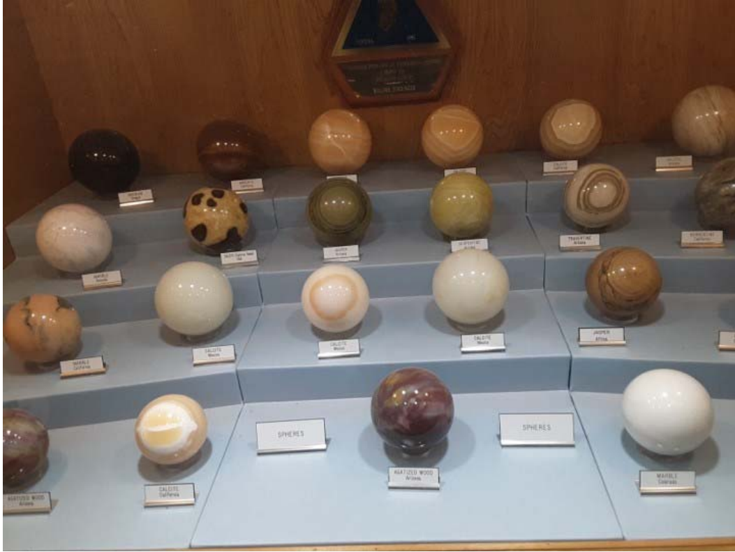
Part of the Collection of Polished Mineral Balls Cut out of Geologic Deposits in the Area