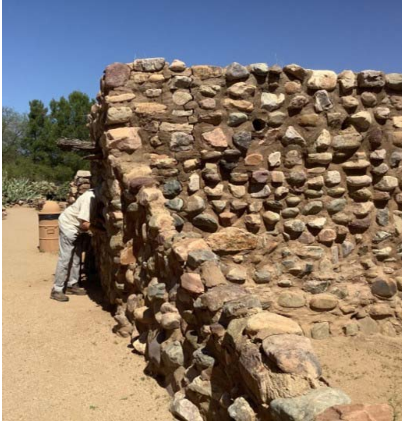
Alternatively, Peek in through Openings