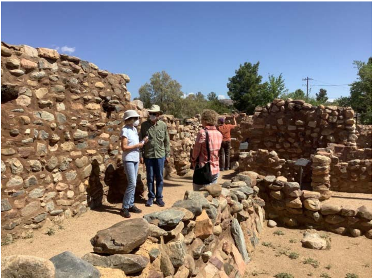
Section of Besh Ba Gowah to the Right near End of Corridor