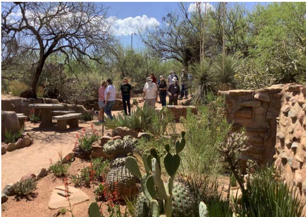
Part of the Restored Section of Gila Pueblo

Besh Ba Gowah and Gila Pueblo were contemporaneous, but Besh Ba Gowah had been abandoned by the time of the destruction of Gila Pueblo in the early 1400s. The archaeological evidence is that it succumbed to a violent and powerful attack. The remains of some 70 people were found, laying out in the open, unburied, men, women, young children, infants. Only one teenager was found. Much foodstuff was left untaken. Speculation is that it was a slave raid from another village in the area.