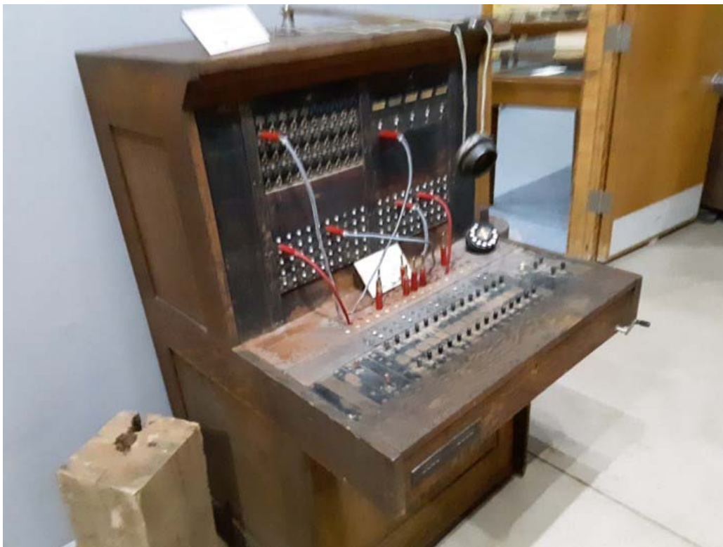
On to the Electrical Age, with a Telephone Switchboard, with a Phone Dial, Before the Digital Age