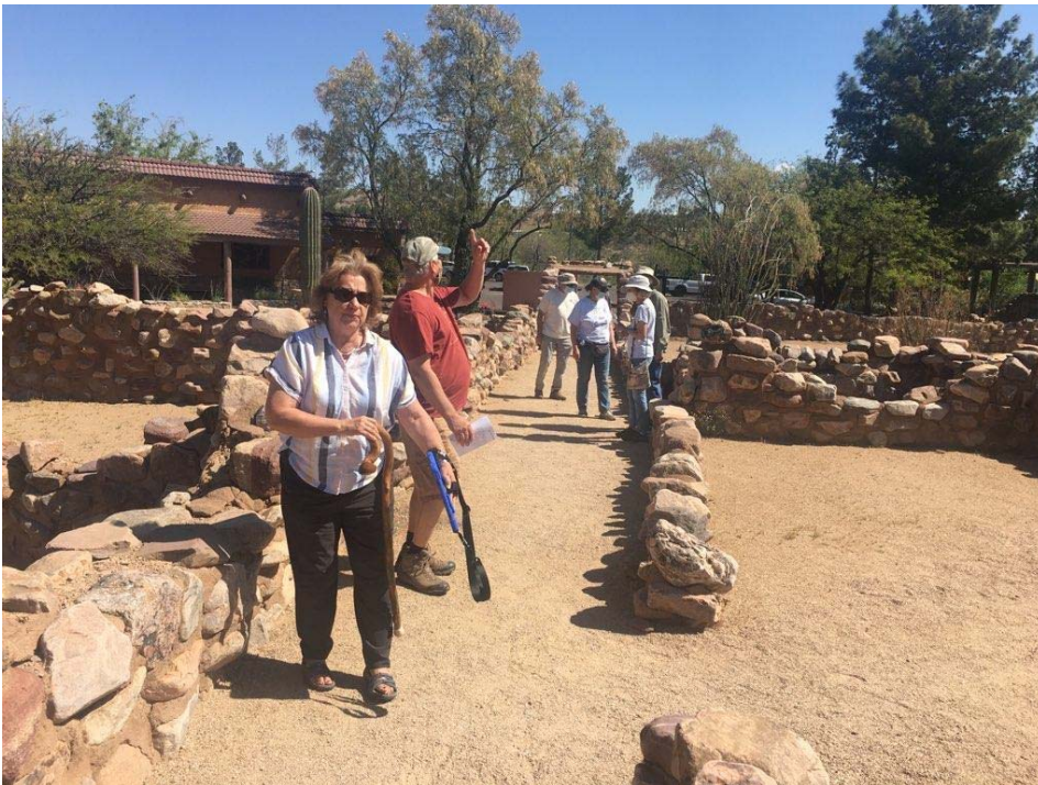
Field Trippers in the Besh Ba Gowah Entry Corridor

Looking down the Besh Ba Gowah corridor from the entrance opening.