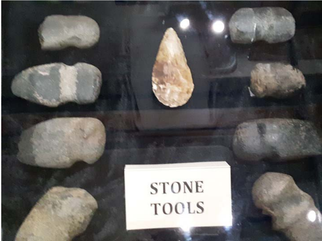
The Bullion Museum has a Small Collection of Local Historic and Prehistoric Native American Made Items