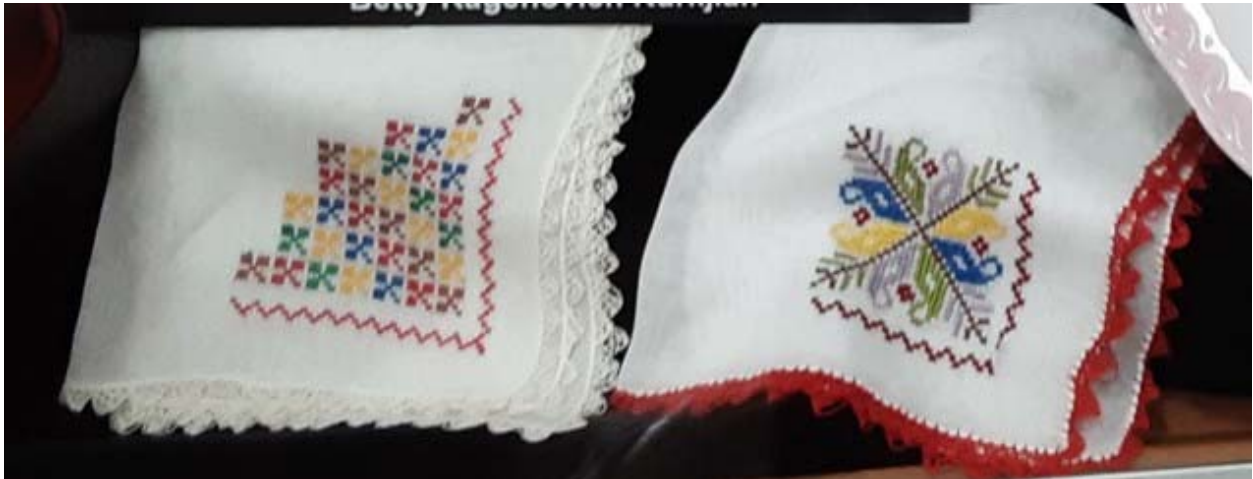
Hand Embroidered Napkins from Slavic Family Settlers in Miami, Arizona