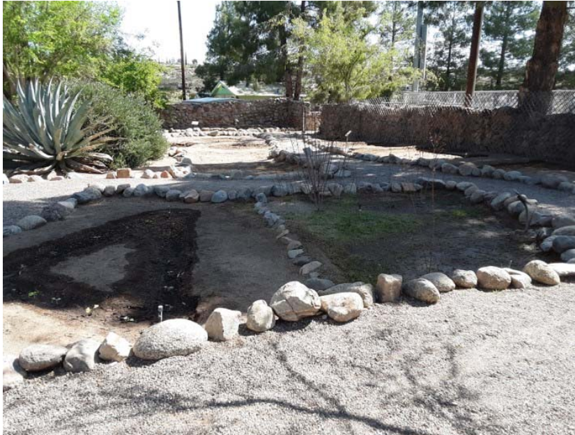
View of the Besh Ba Gowah Cultural Ethno-Botanical Garden

For years I had read that a common food plant grown by Prehistoric Americans was amaranth. I had no idea what that was. Since that time, I have seen photos and live plants of amaranth. I recognized it as a weed my father warned me about as a boy ... "Pull these Careless Weeds up before they go to seed. They make a million seeds. If you don't get them in time, you will really have them next year." A Botany Professor told me that "A weed is a plant we just haven't figured out what it's good for yet. We should not blame it for our own failings." The Prehistoric Americans figured out that amaranth seeds were good to eat and nutritious, although small. They knew what amaranth was for and had domesticated it.