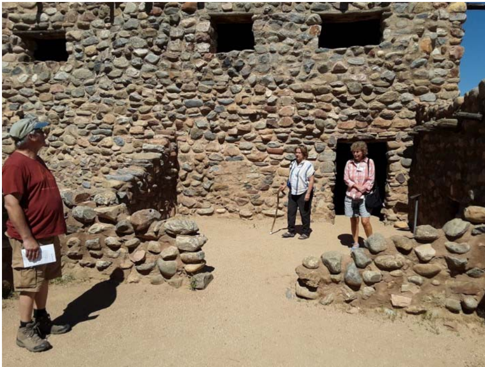
Having Passed through the Two-Story Reconstruction from the Corridor and Emerging on the Other Side