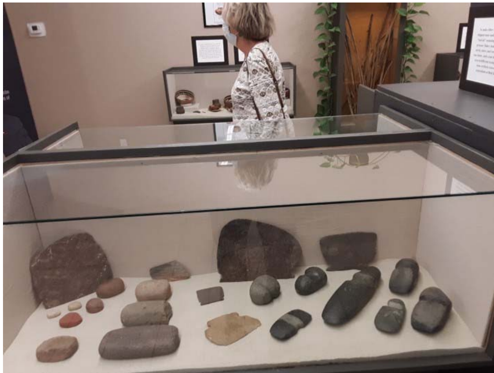
Polishing Stones, Manos, Ground Axe Heads, and other Stone Tools at Besh Ba Gowah