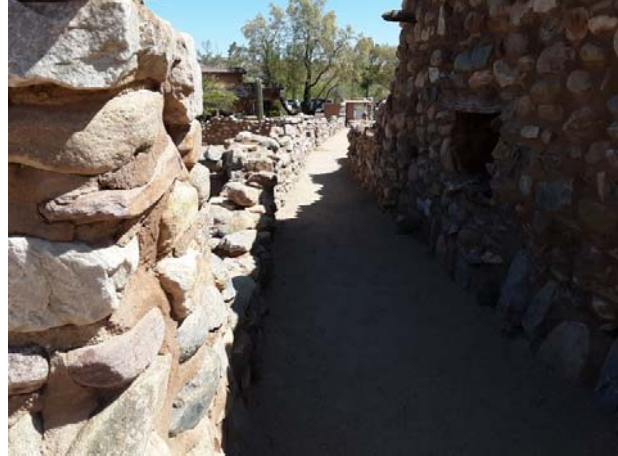
Looking Back towards the Entrance from the Interior End of the Besh Ba Gowah Entry Corridor