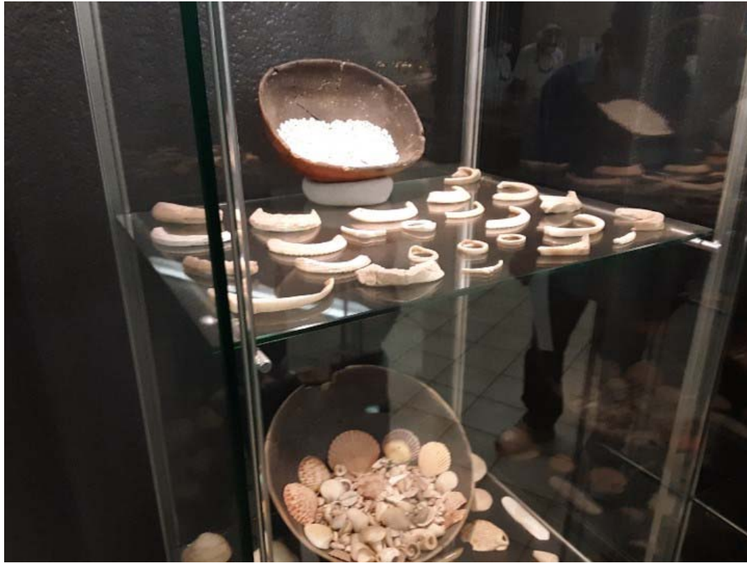
Display of Some Seashells and Shell Ornaments (Broken Bracelets Mostly) found at Besh Ba Gowah