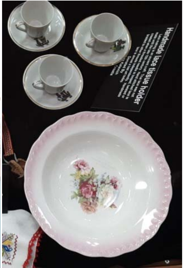
Decorated Slavic Cups and Bowl