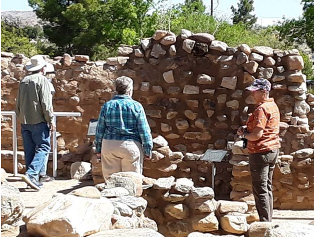
Turning Around and Looking in the Opposite Direction from the Previous Photo, away from the Two-Story Structure