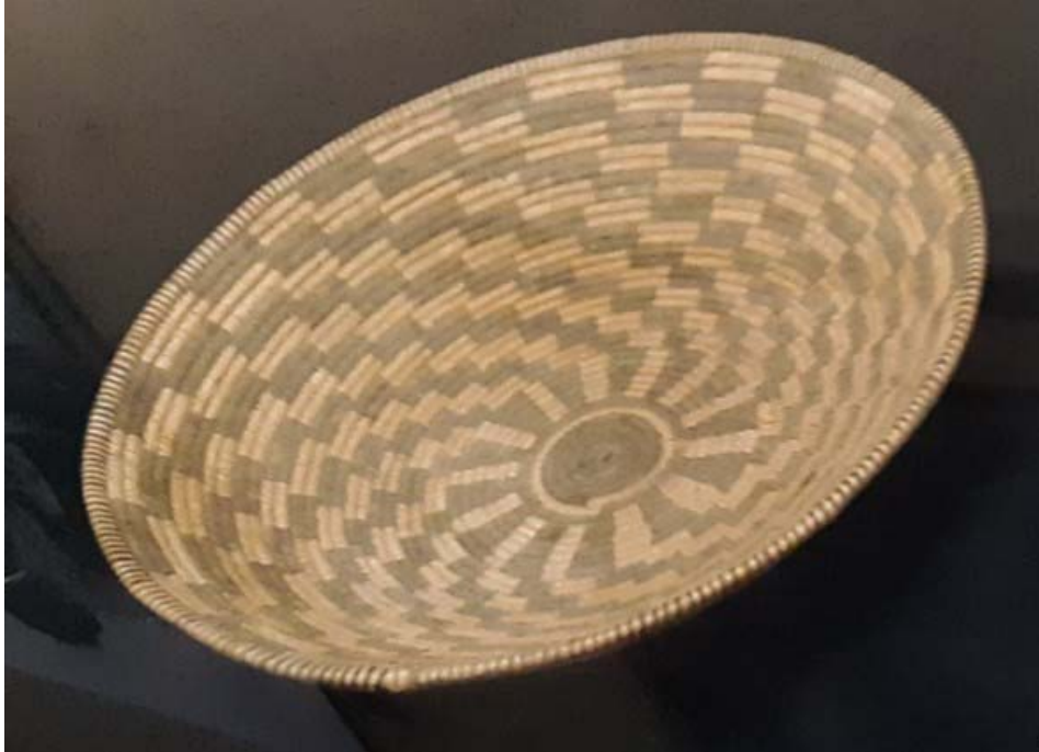
One of Several Apache Baskets on Display

Most of the Bullion Museum was devoted to historical items from the late 19 th and early 20 th Centuries. Besides Anglo-Americans, two major ethnic groups that early settled in Miami were Mexicans and East European Slavic peoples. The museum has display sections about both groups.