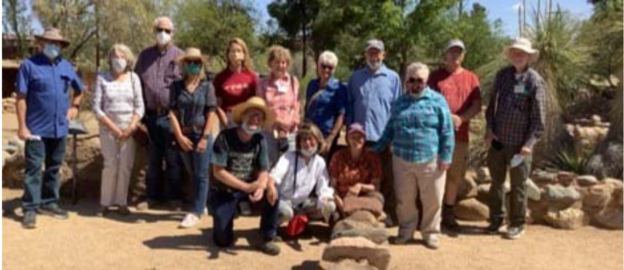
Field Trippers at Besh Ba Gowah