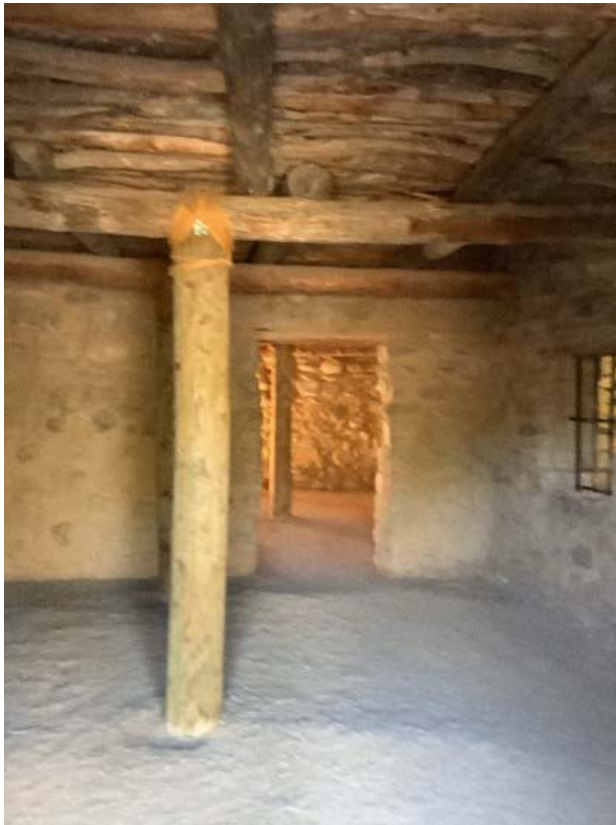
A Passageway through the Reconstructed Two-Story Leads to the Other Side