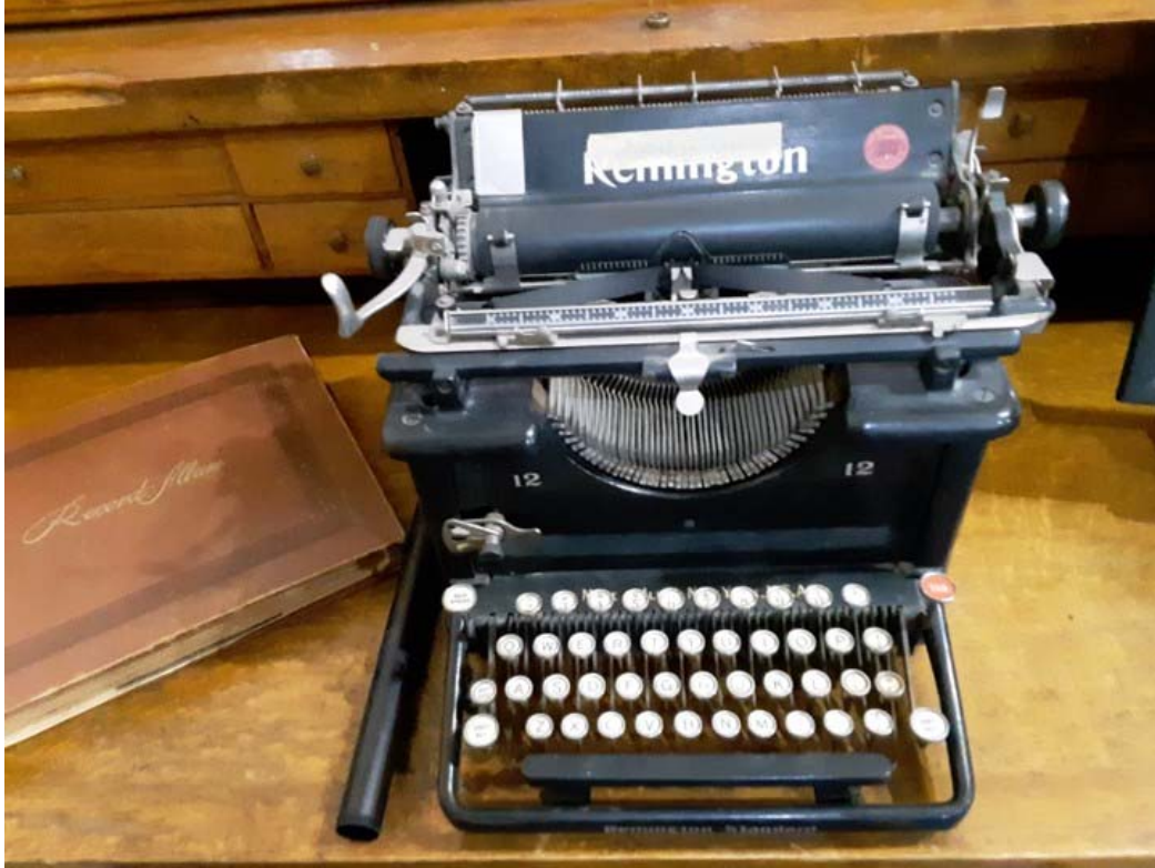
Keyboarding with an early Manual Powered Typewriter, Back when Finger Buttons were Round