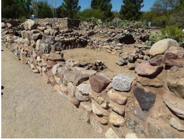
Coming Up the Corridor from the Entrance and Looking to the Right