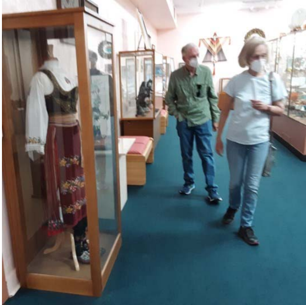
Field Trippers Strolling through the Slavic Section of the Bullion Center Museum