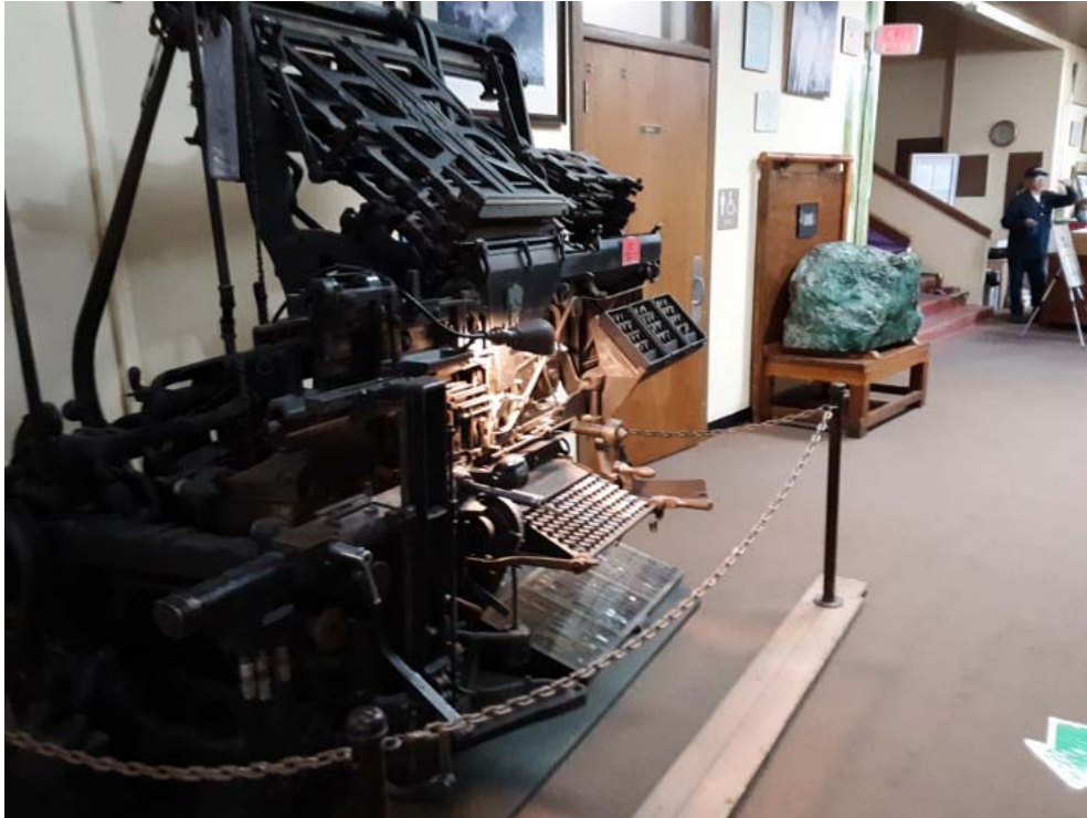
A Linotype Machine, for Preparing a Line of Print Characters from Molten Metal. These machines were used from the 1880s to the 1980s for typesetting for printing. The Digital Age of computers ended them