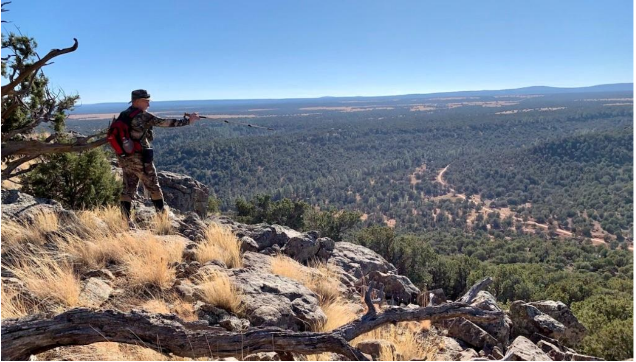
The View from Above Chavez Pass