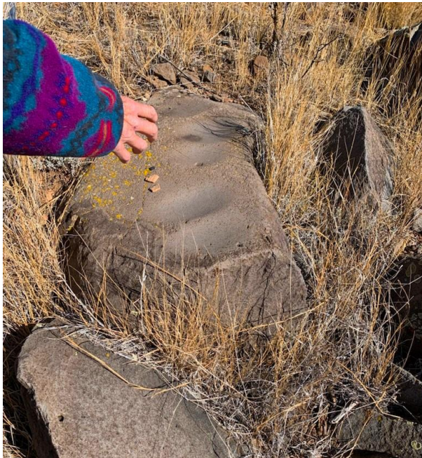
Ground Stone at Chavez Pass