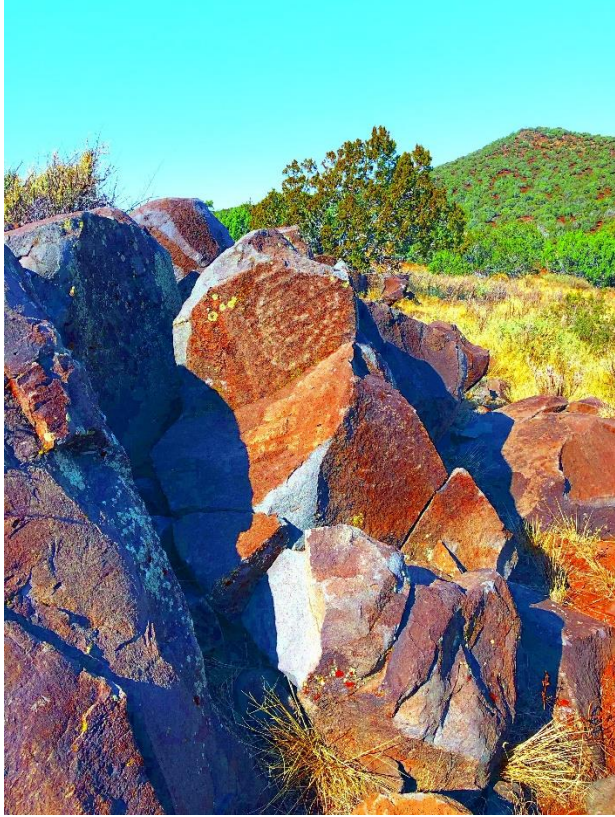
A Chavez Pass Petroglyph Color Enhanced for Visibility