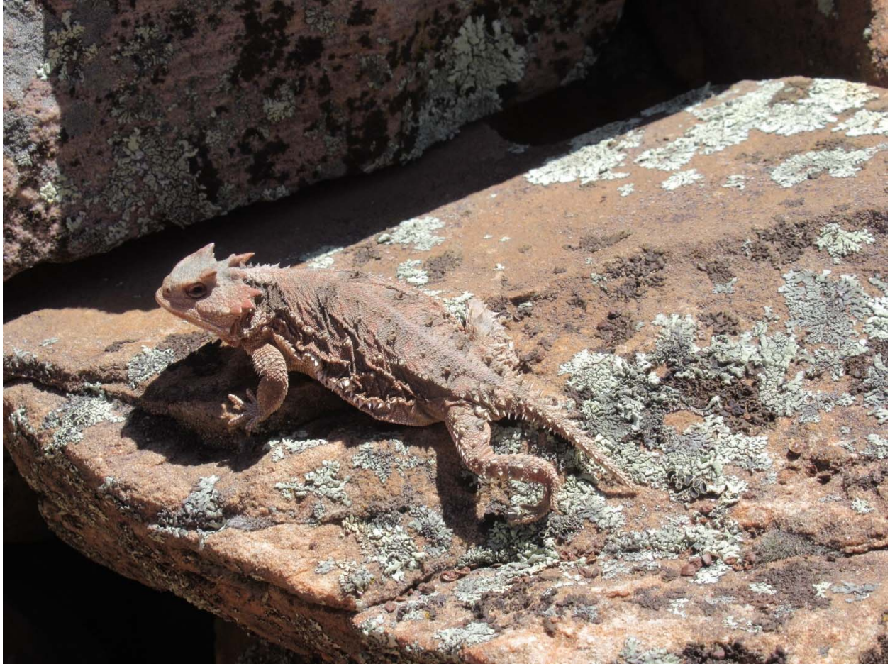
A Resident of Portal IV in Pine, Arizona A Horned Toad A Kind of Lizard, Formidable Looking but Harmless , Protected by Law