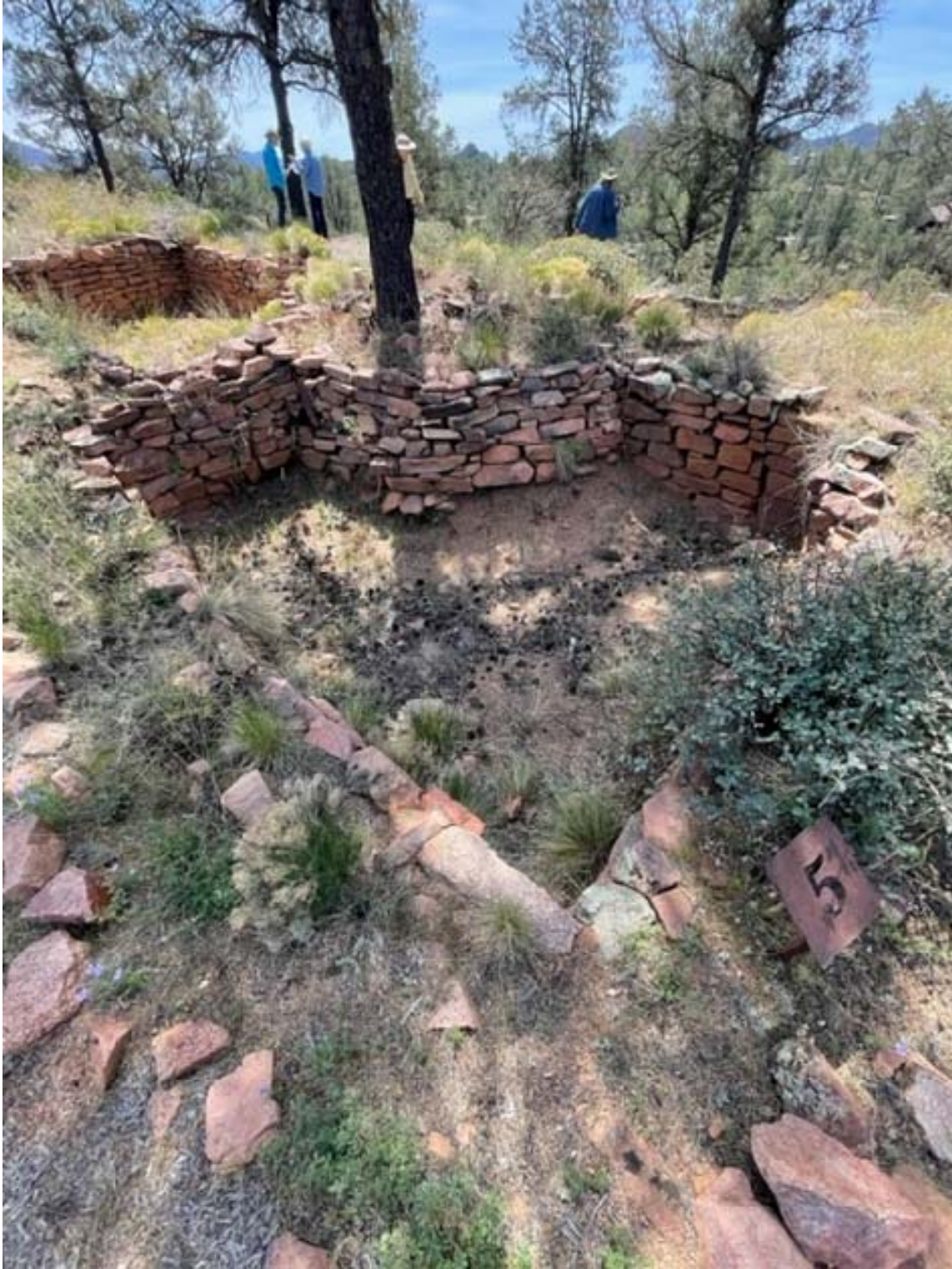
Two rooms at Chaparral Pines