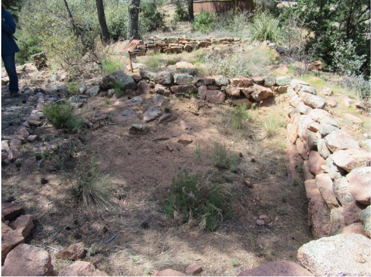
Two Rooms at Chapparal Pines Ruin in Pine