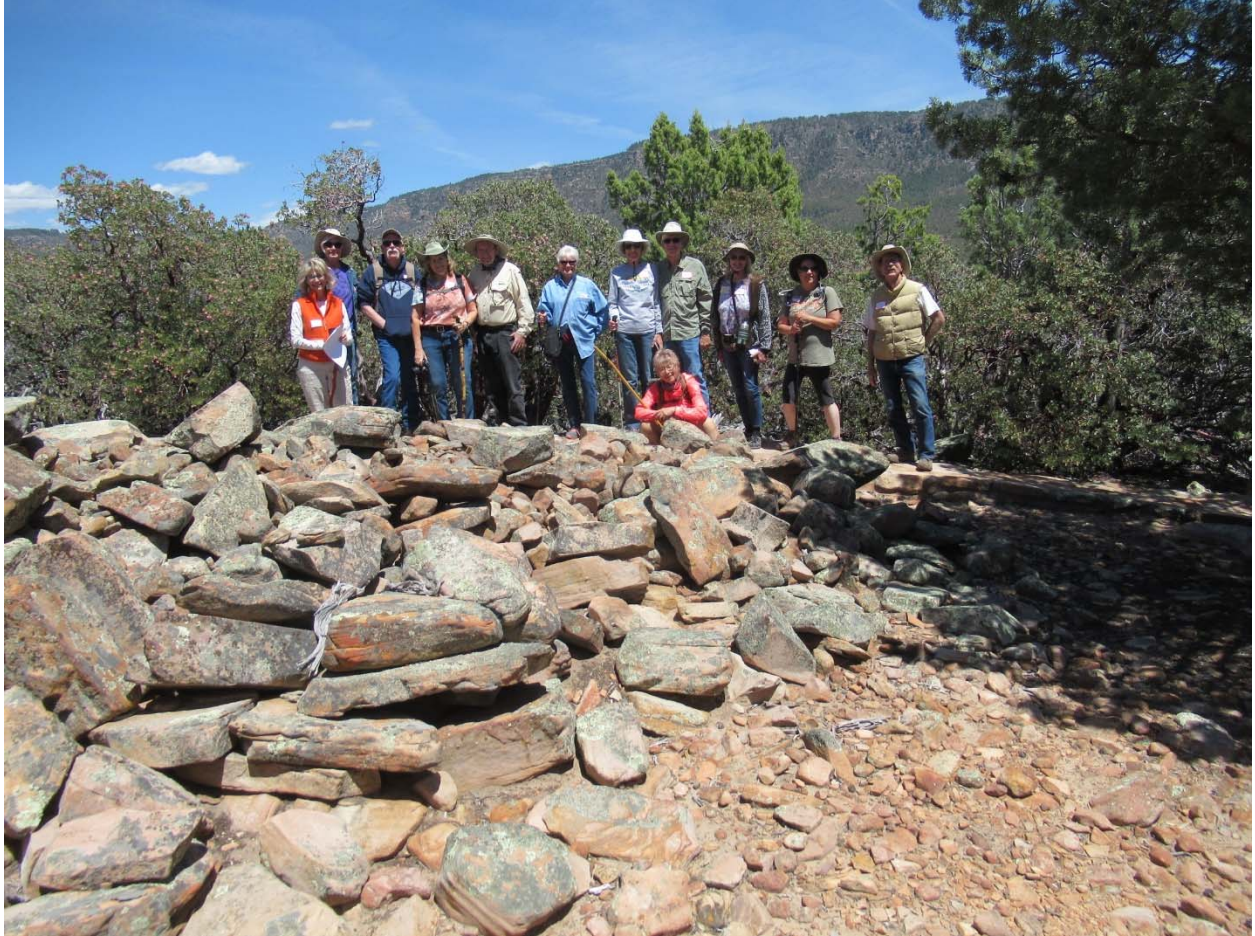
Field Trippers at Portal IV Ruin in Pine