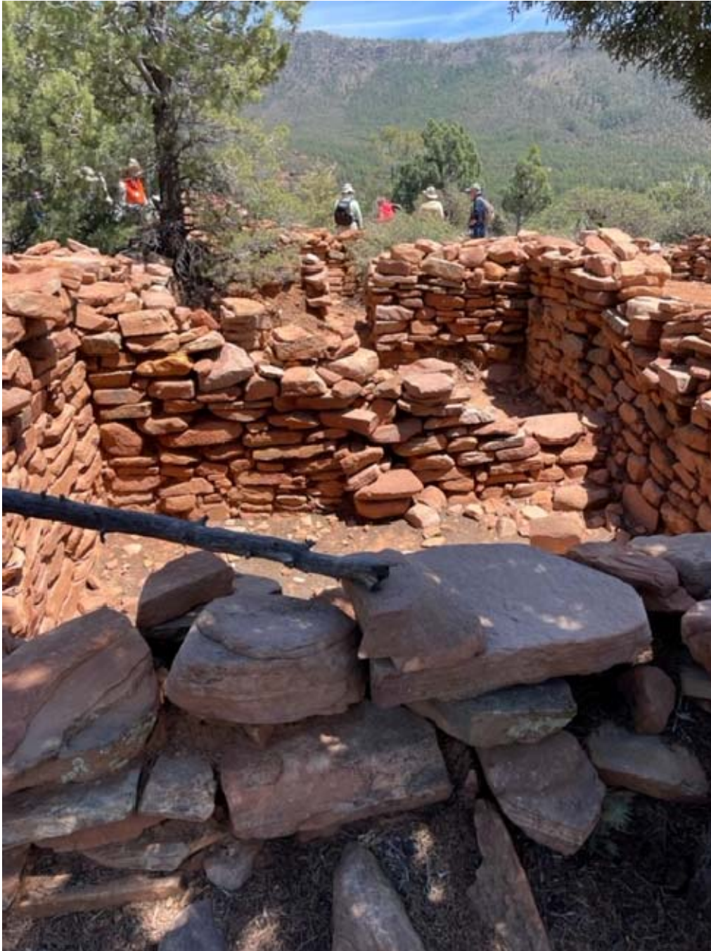
Two Rooms at Portal IV