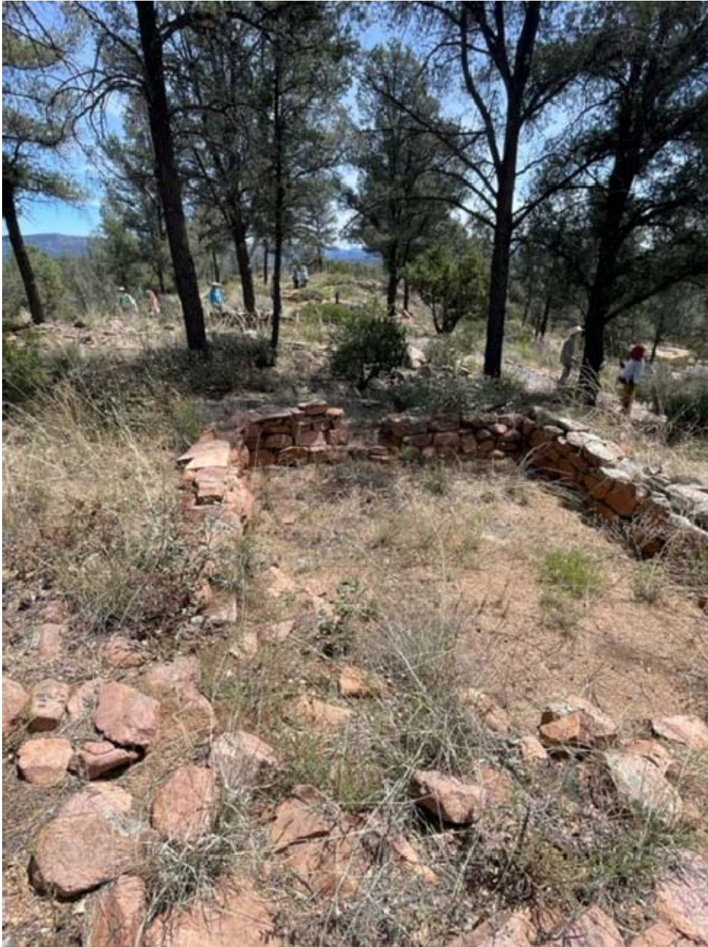
View of Some Rooms at Chaparral Pines