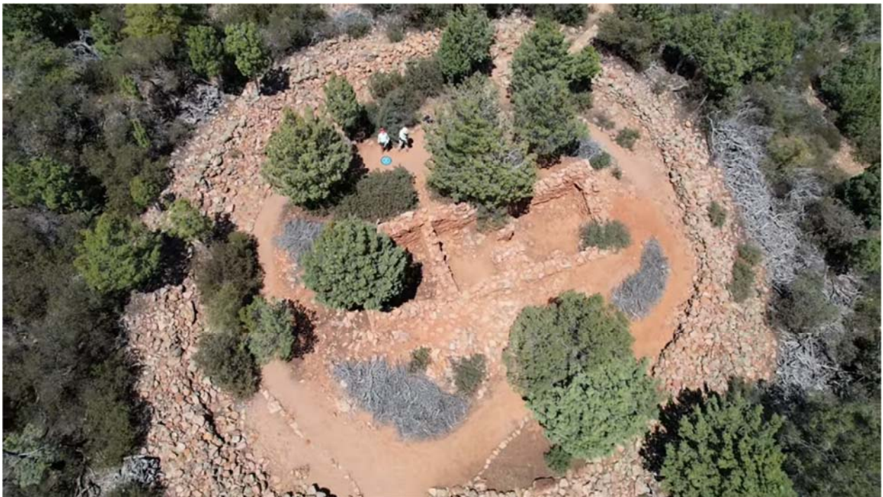
Aerial View of Portal IV Hilltop Ruin