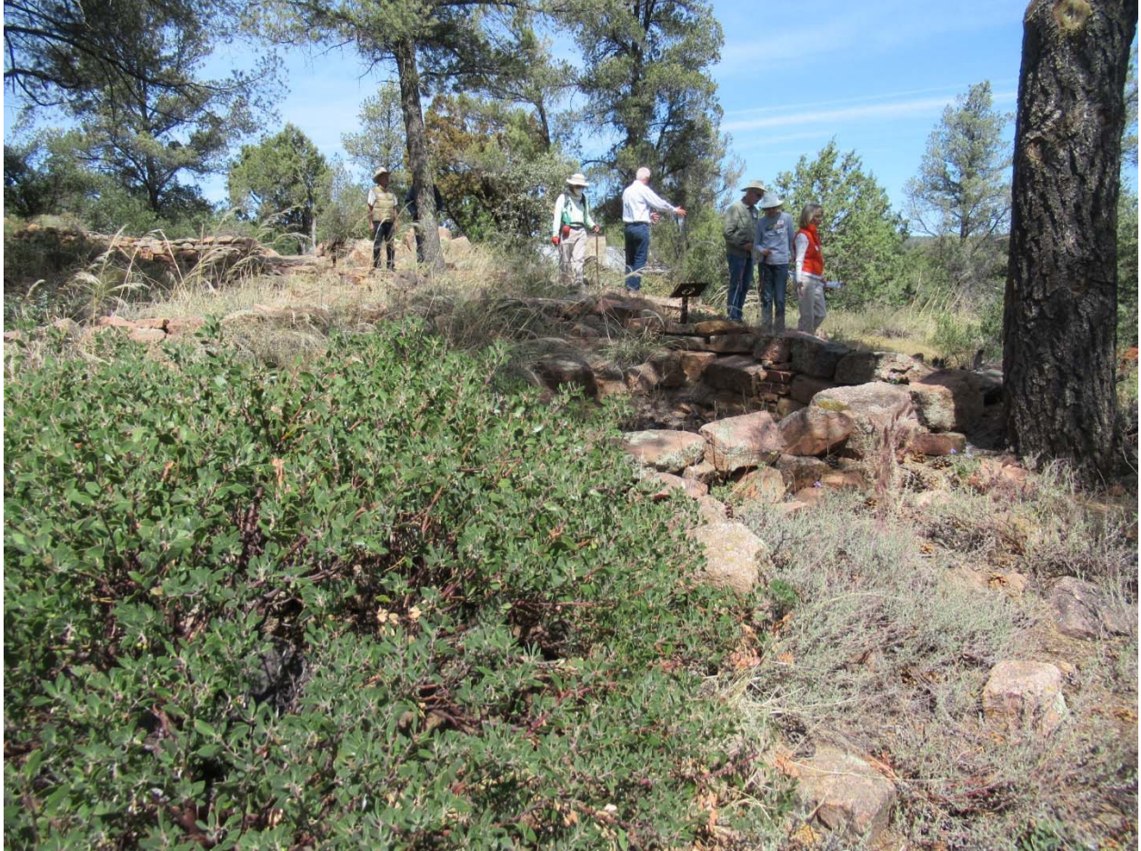
Field Trippers at Chapparal Pine Ruin