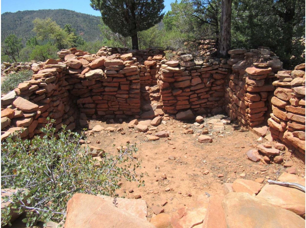
A Wider View of the Doorway and Room at Portal IV