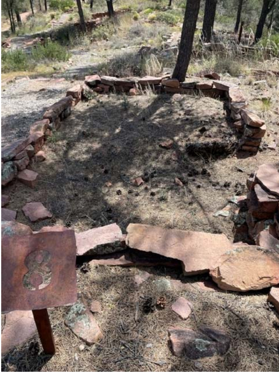
A Small Room at Chaparral Pines