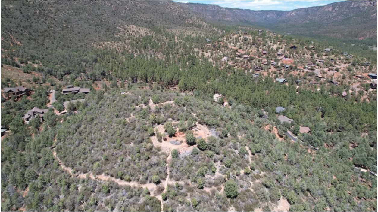
Portal IV Hilltop Ruin