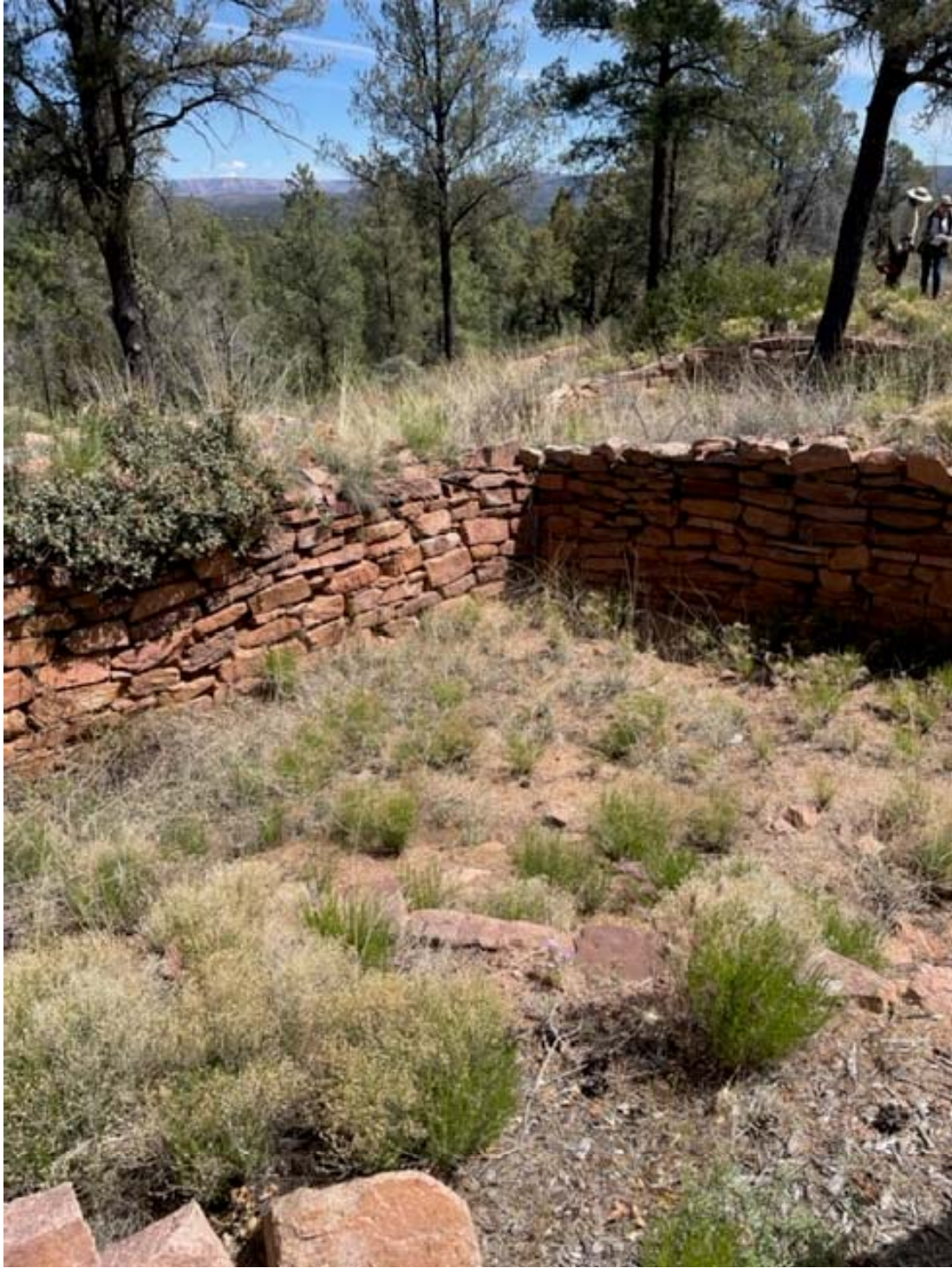
Room Corner at Chaparral Pines