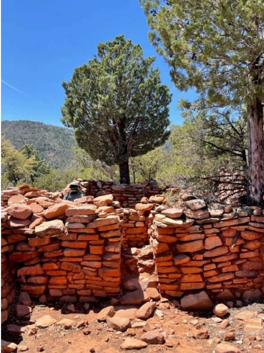
Doorway at Room in Portal IV