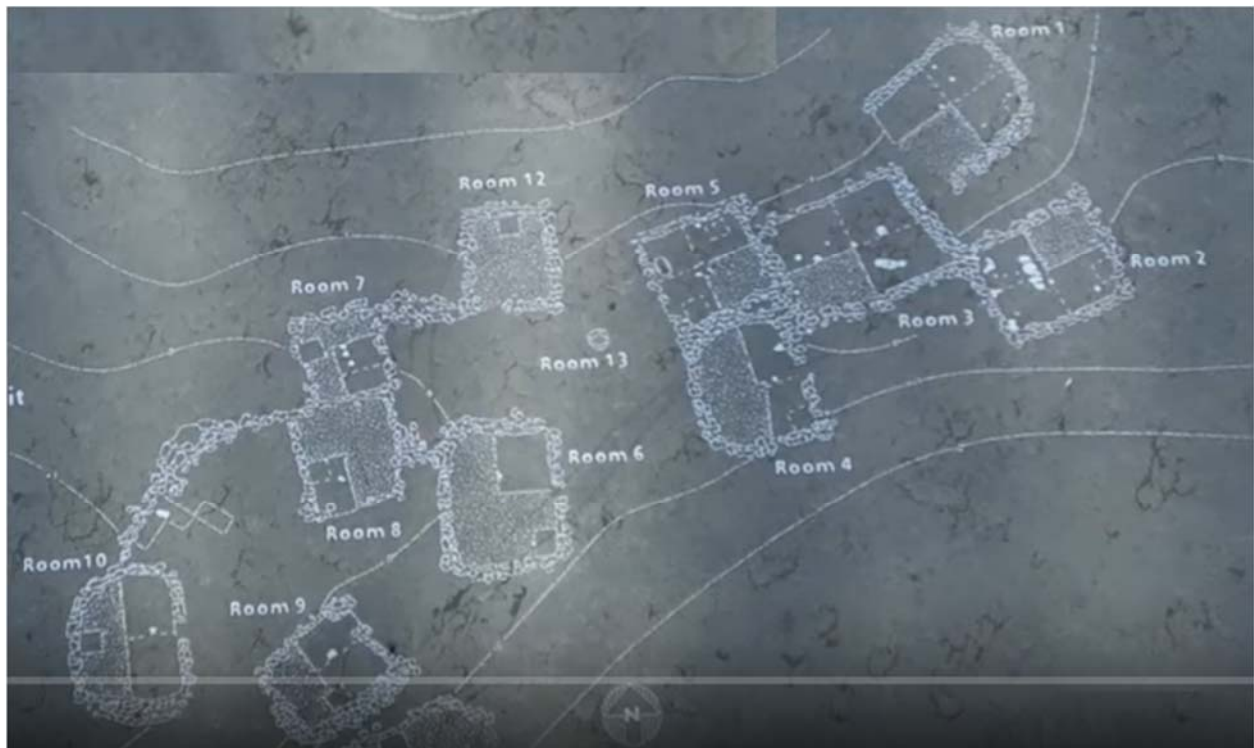
Chaparral Pines Site Plan