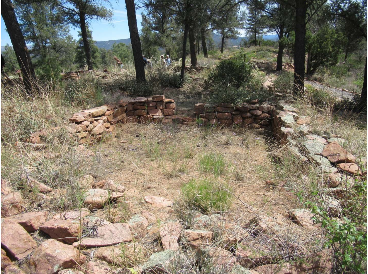
Rooms at Chapparal Pines