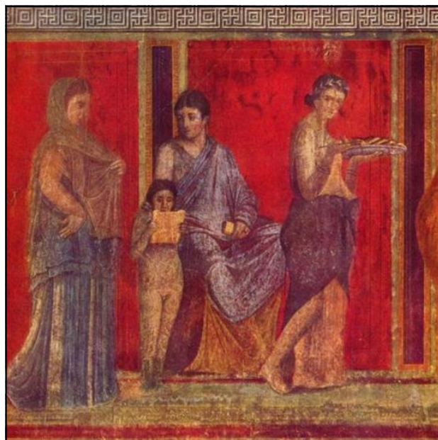
Detail of a fresco from Villa of the Mysteries, Pompeii